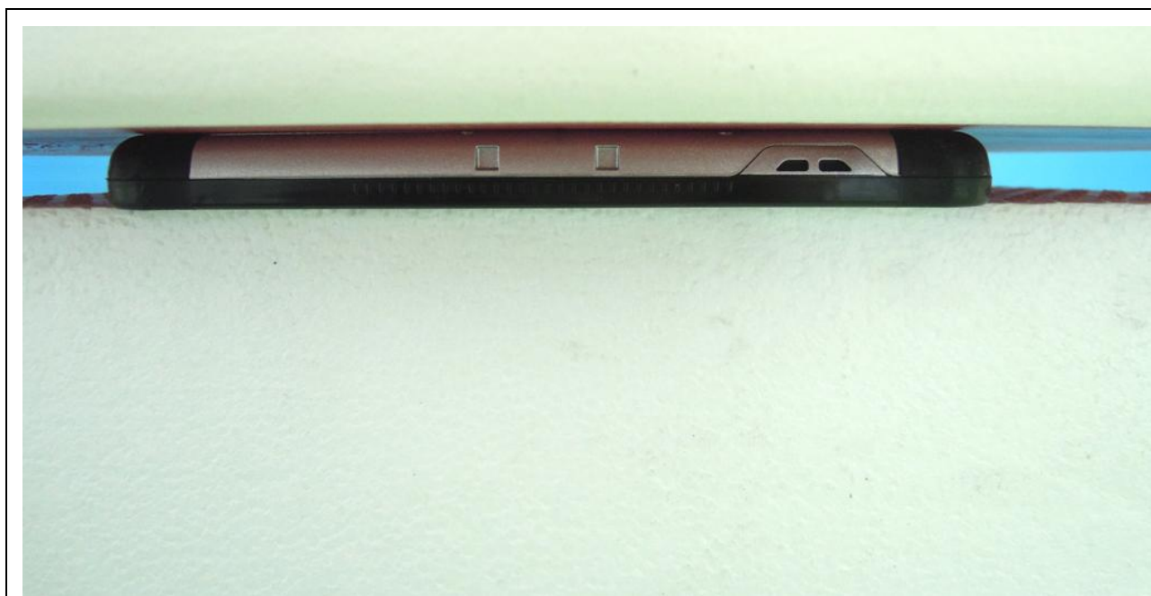
SAR Test Position : Rear Face with 0 mm Gap

Note: The rear face of this device is completely flat. For SAR testing, the rear face of this device is parallel and touches the flat phantom.