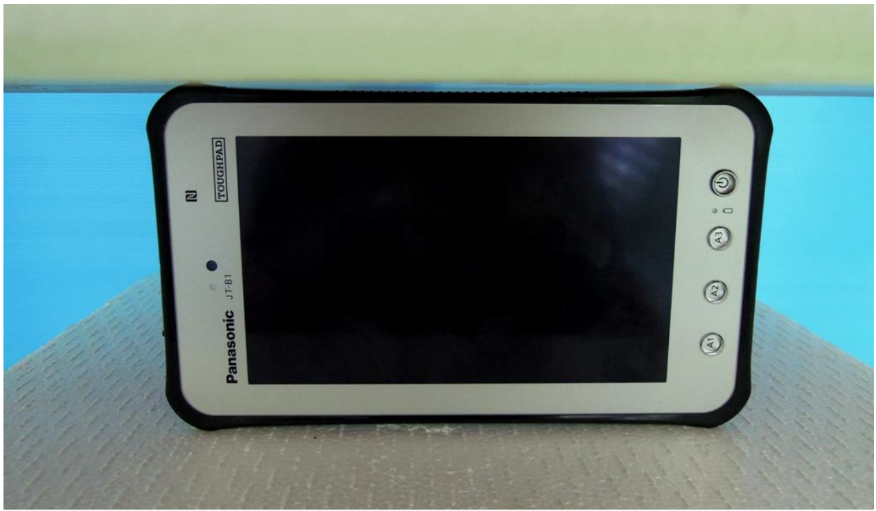
SAR Test Position : Secondary Landscape with 0 mm Gap