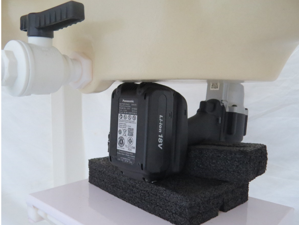
Picture 3: Front Side, the distance from EUT to the bottom of the Phantom is 0mm