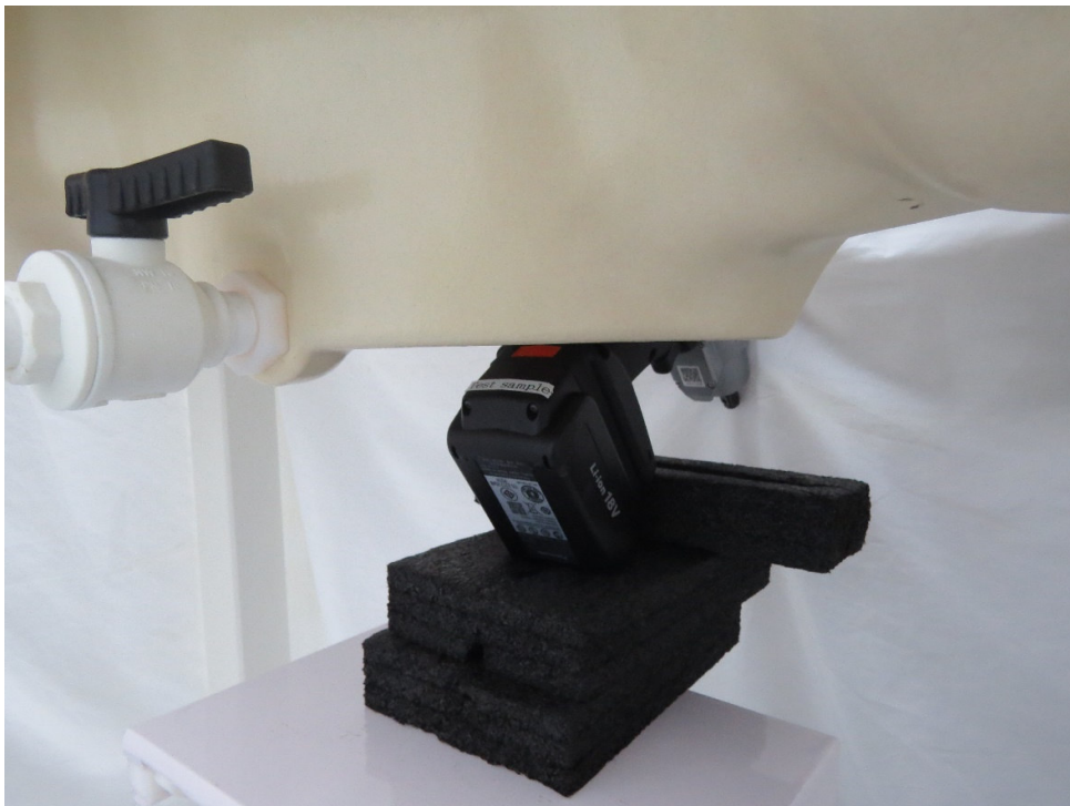
Picture 2: Back Side2, the distance from EUT to the bottom of the Phantom is 0mm