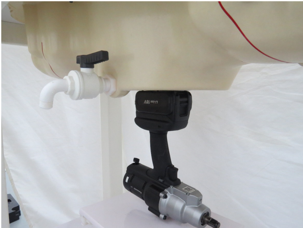
Picture 6: Bottom Edge, the distance from EUT to the bottom of the Phantom is 0mm