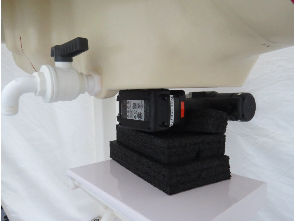
Picture 5: Right Edge, the distance from EUT to the bottom of the Phantom is 0mm