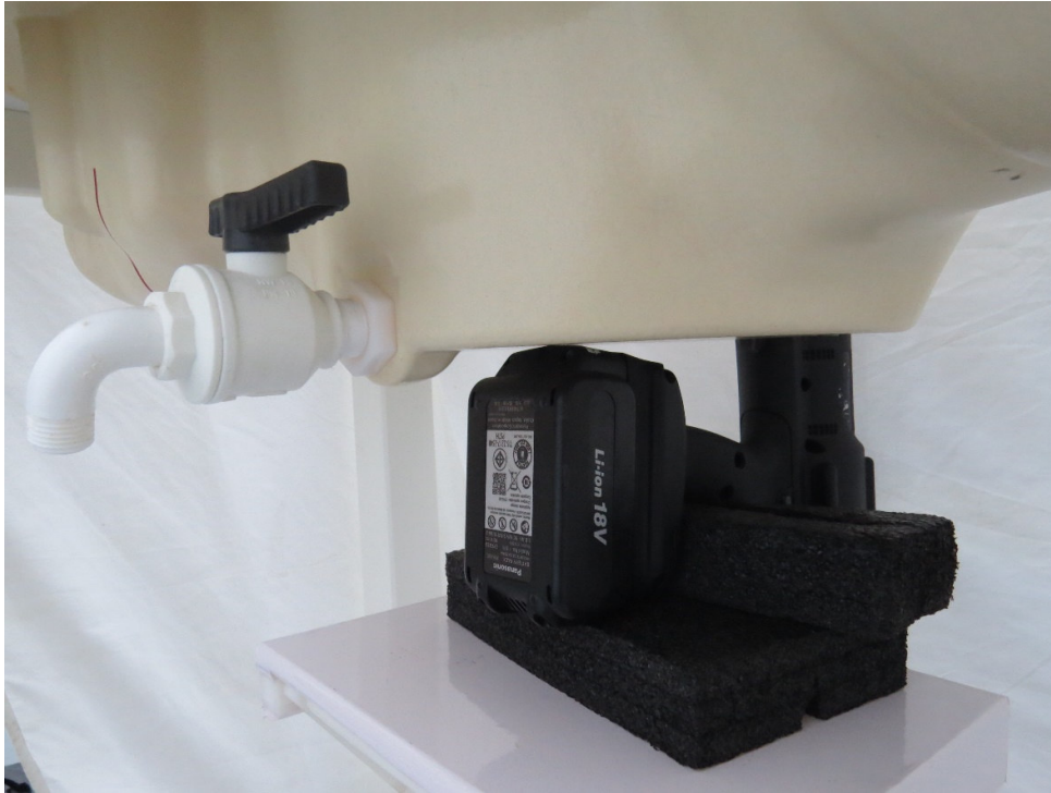
Picture 1: Back Side, the distance from EUT to the bottom of the Phantom is 0mm