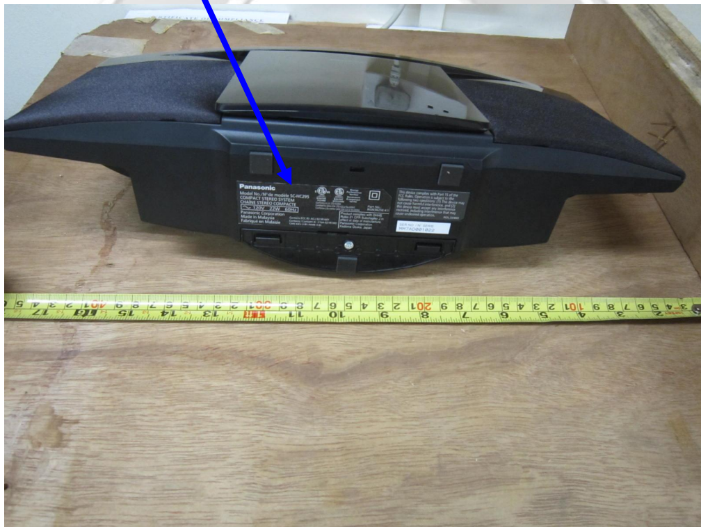
Physical Location of FCC Label on EUT