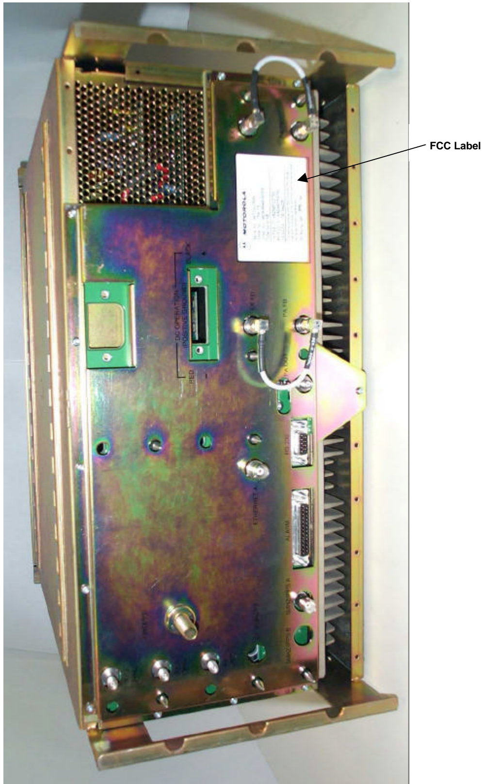
Rear of Base Radio Including Location of the FCC ID Label