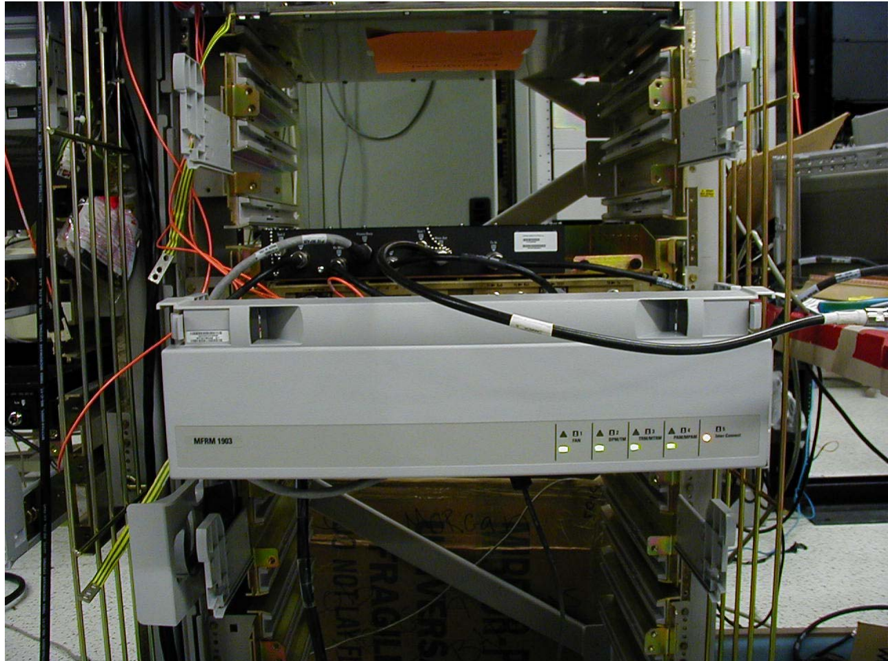
Nortel Networks MFRM Assembly Front View Fan Assembly Mounted

This document contains Proprietary information of Nortel Networks. This information is considered to be confidential and should be treated appropriately.