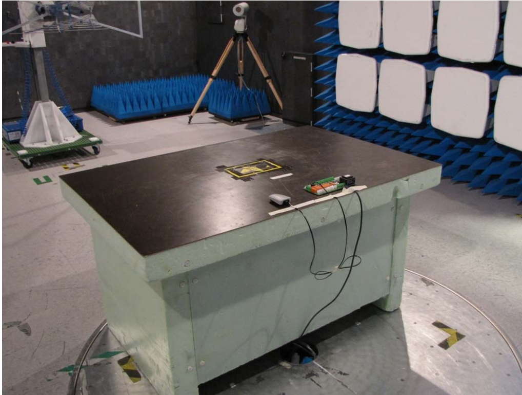
Radiated spurious emission 30-1000 MHz