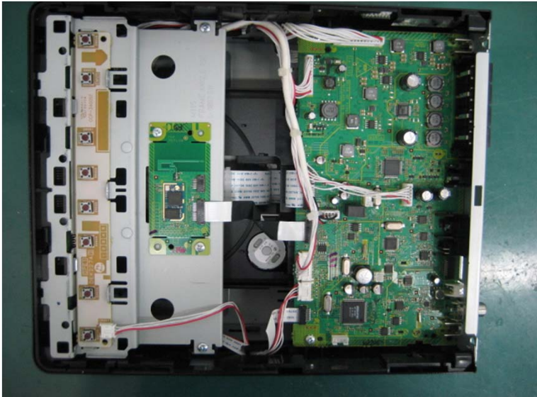
The connecting portion of the module