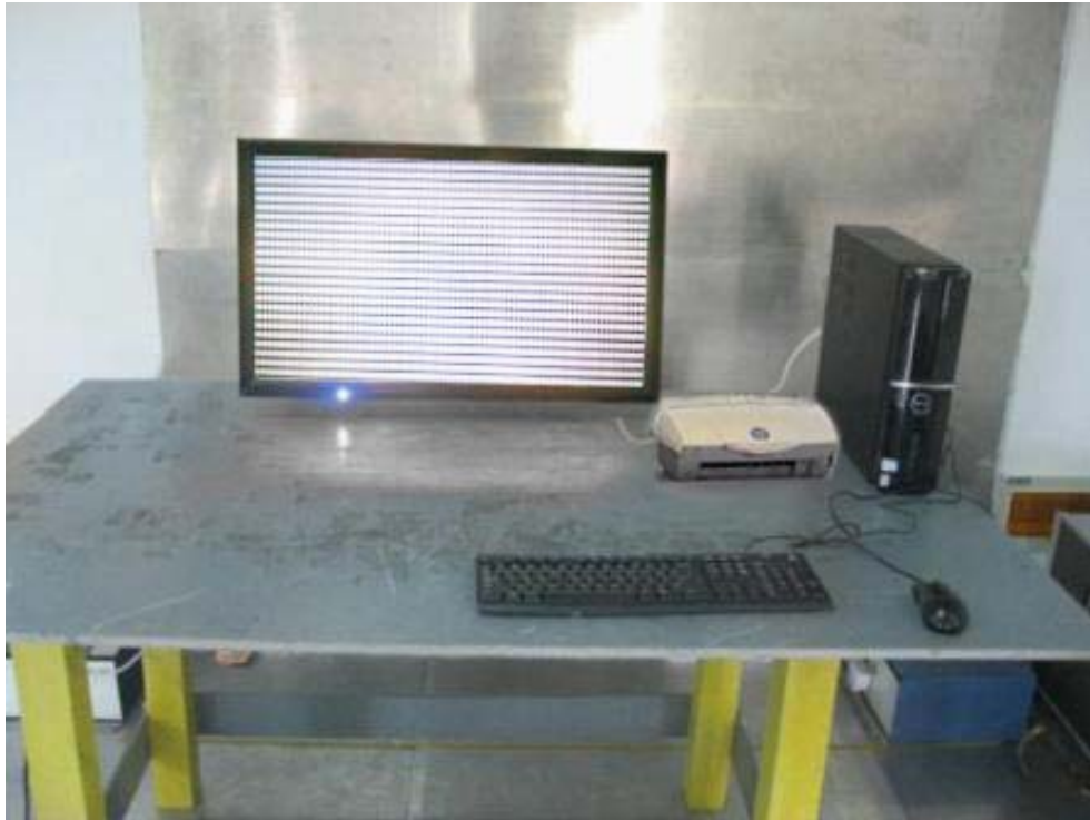
Conducted Emission – Front View