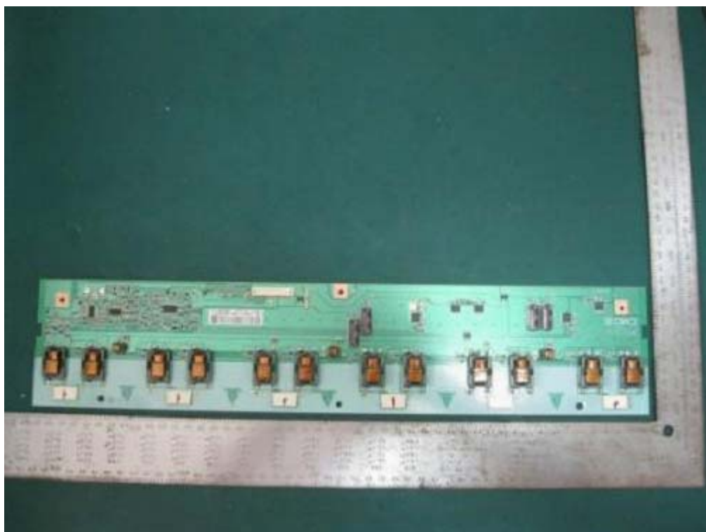
EUT – Panel Inverter Board Top View