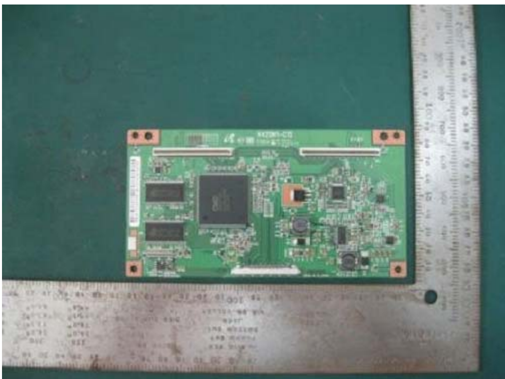
EUT – Panel Main Board Top View