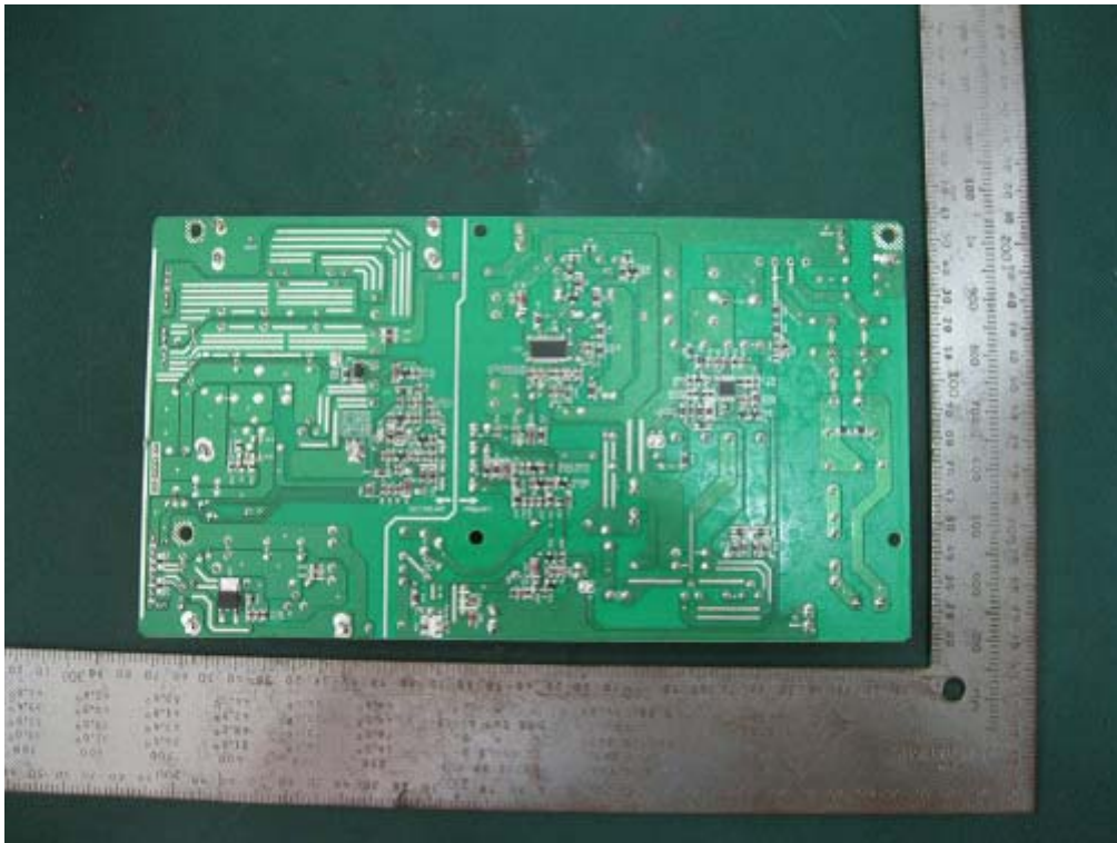
EUT – Power Board Bottom View