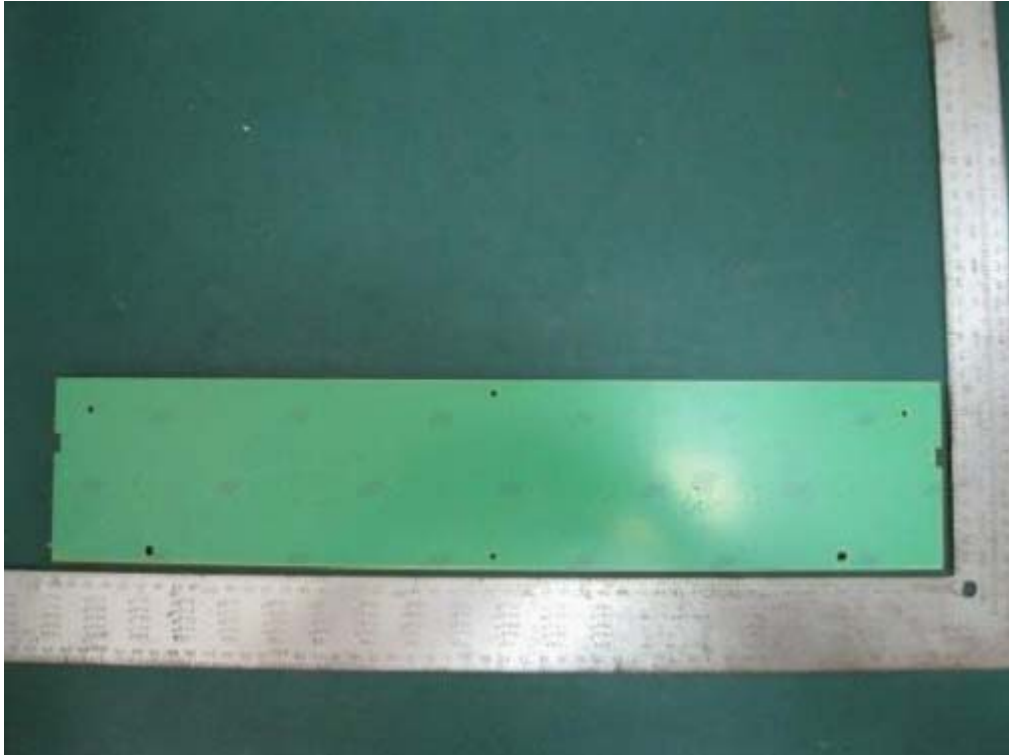
EUT – Panel Inverter Board Bottom View