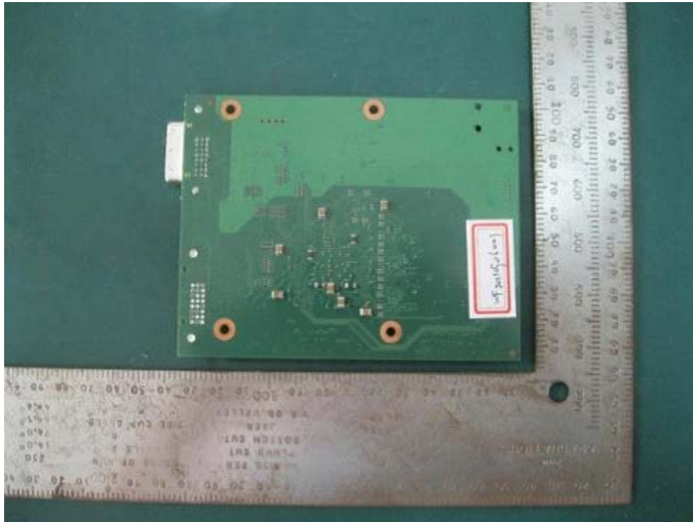
EUT – Main Board Bottom View