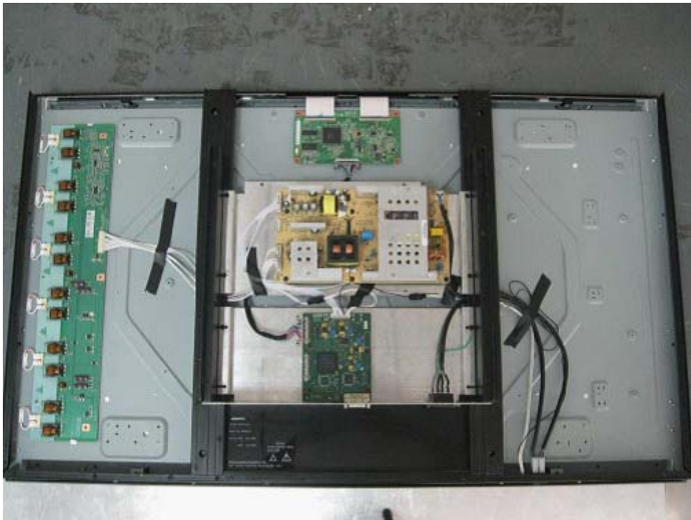
EUT – Component View Shield ON