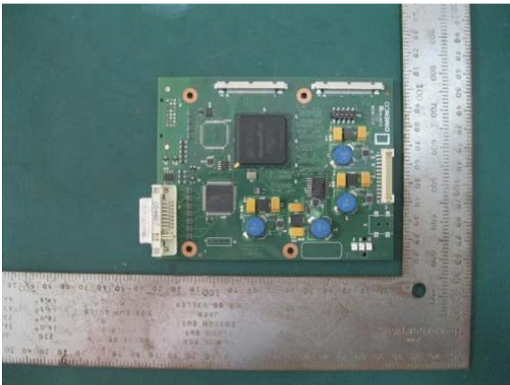
EUT – Main Board Top View