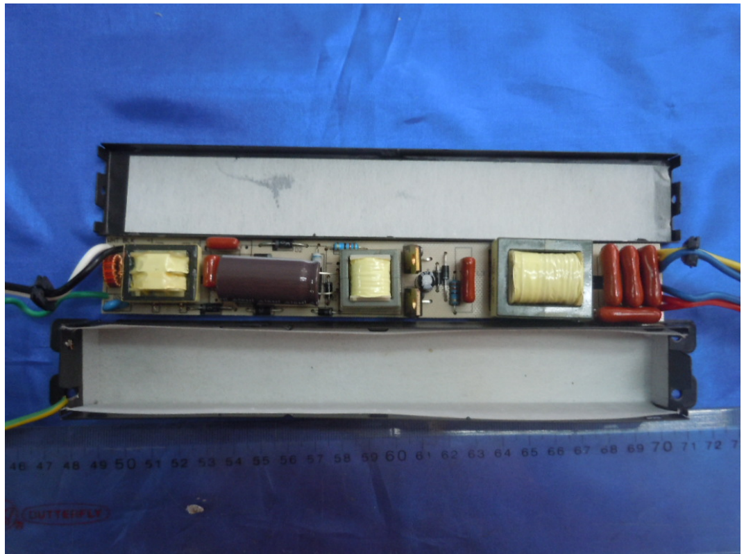
FIGURE 1 FLUORESCENT LAMP BALLAST (M/N: BEB/120/432) COVER REMOVED