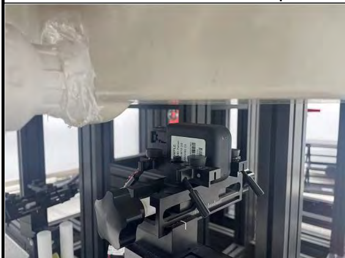
Left Side of EUT with 2.0 cm Gap