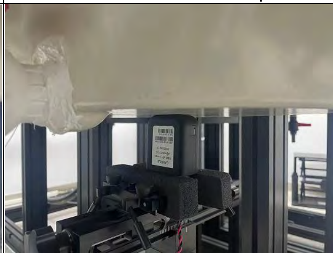
Top Side of EUT with 0 cm Gap