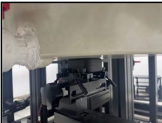
Rear Face of EUT with 0 cm Gap