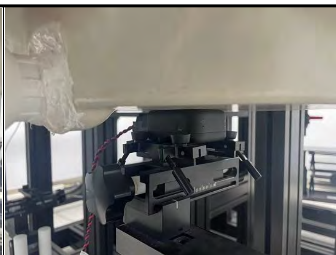
Front Face of EUT with 0 cm Gap