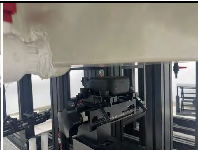
Rear Face of EUT with 2.0 cm Gap