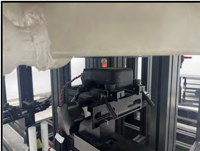
Front Face of EUT with 2.0 cm Gap