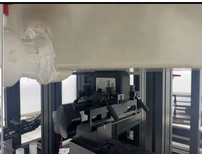
Left Side of EUT with 0 cm Gap