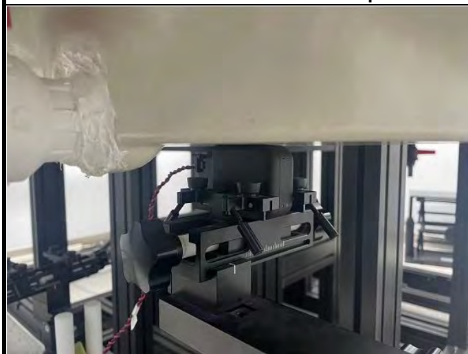
Right Side of EUT with 0 cm Gap