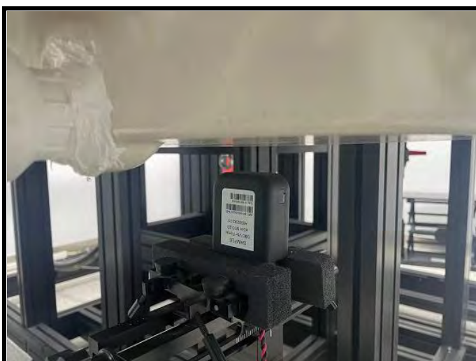
Top Side of EUT with 2.0 cm Gap