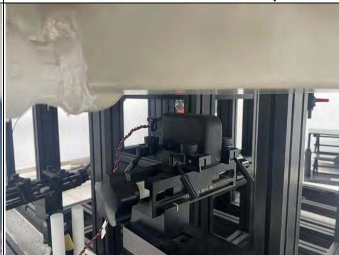
Right Side of EUT with 2.0 cm Gap