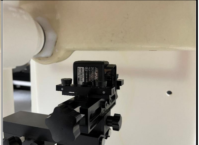
Right Side of EUT with 1.5 cm Gap