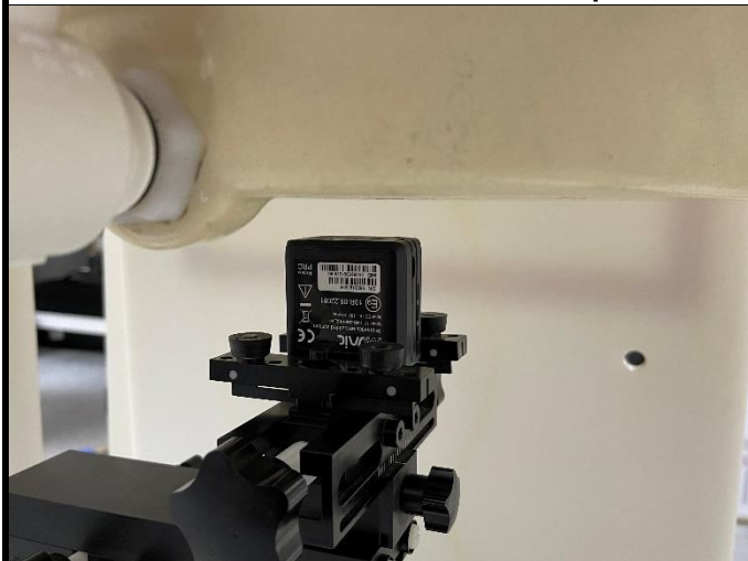
Top Side of EUT with 1.5 cm Gap