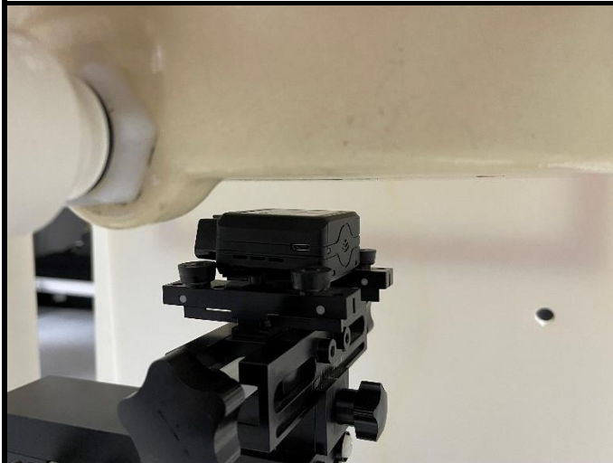
Front Face of EUT with 1.5 cm Gap