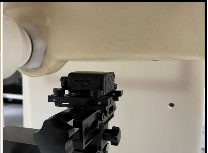
Rear Face of EUT with 1.5 cm Gap