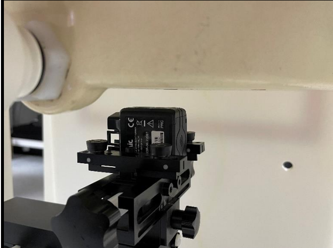
Left Side of EUT with 1.5 cm Gap