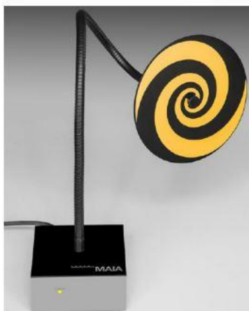
Modulation and Interference Analyzer (MAIA)

MAIA is a hardware interface for evaluating the modulation and audio interference characteristics of RF signals in the frequency range 698–6000 MHz, the DASY6 evaluates the time-domain and frequency-domain properties of the uplink signal transmitted by the DUT during SAR measurement with MAIA. It uses USB-powered active electronics to identify the modulation of the DUT. It can be operated with the over-the-air interface using the built-in ultra-broadband planar log spiral antenna (698–6000 MHz) or in the conducted mode using the coaxial SMA 50W connector (300–6000 MHz).