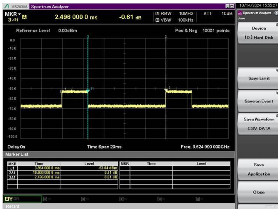
5G FR1 TDD Power Class 1.5

Duty cycle measurement was performed for 5G NR TDD Power Class 1.5 to confirm DUTs operating duty cycle. The Measured Duty cycle will be used for HAC RFAIPL evaluation.