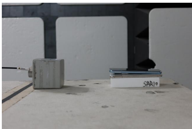
Position E @ 15cm separation distance