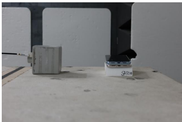
Position D @ 15cm separation distance