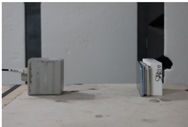
Position B @ 20cm separation distance