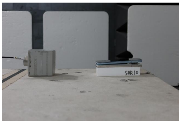
Position F @ 15cm separation distance