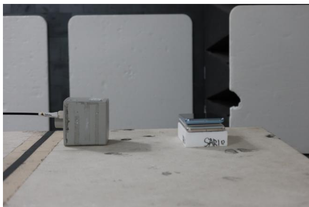
Position C @ 15cm separation distance