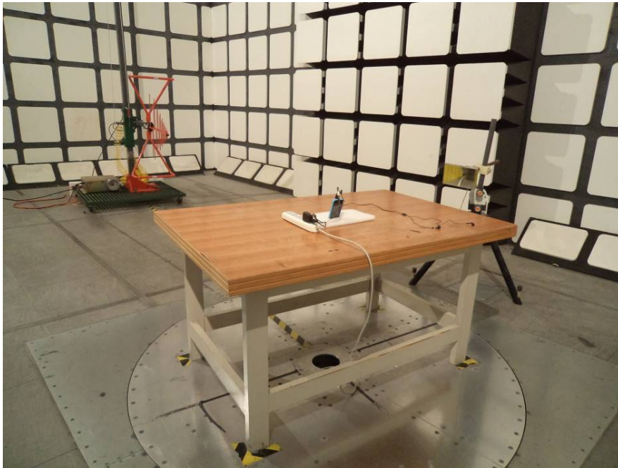
Radiated Emissions – Rear View (30-1000 MHz)