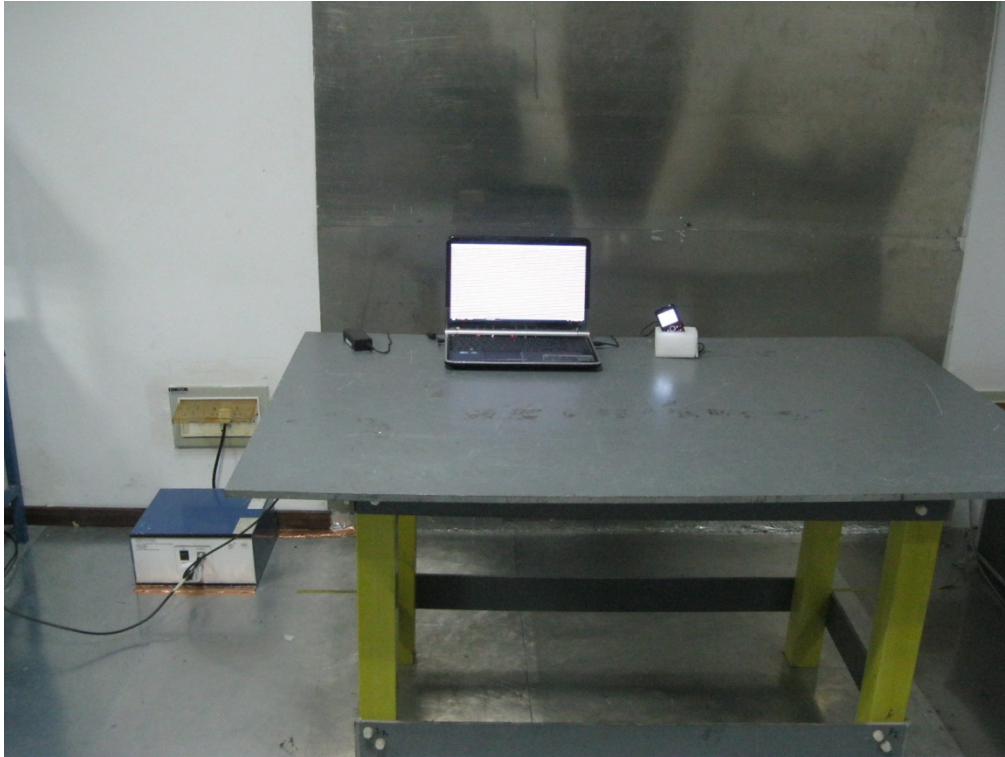
Front View of Conducted Emissions