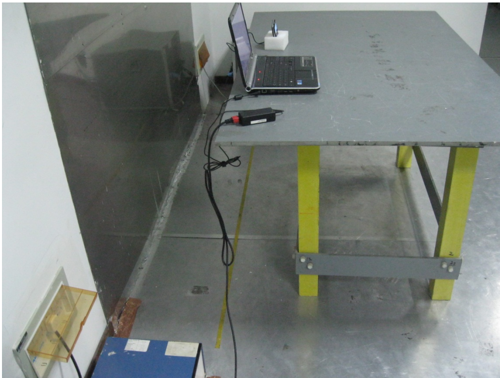
Side View of Conducted Emissions