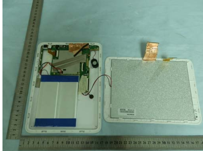
EUT –Uncovered View