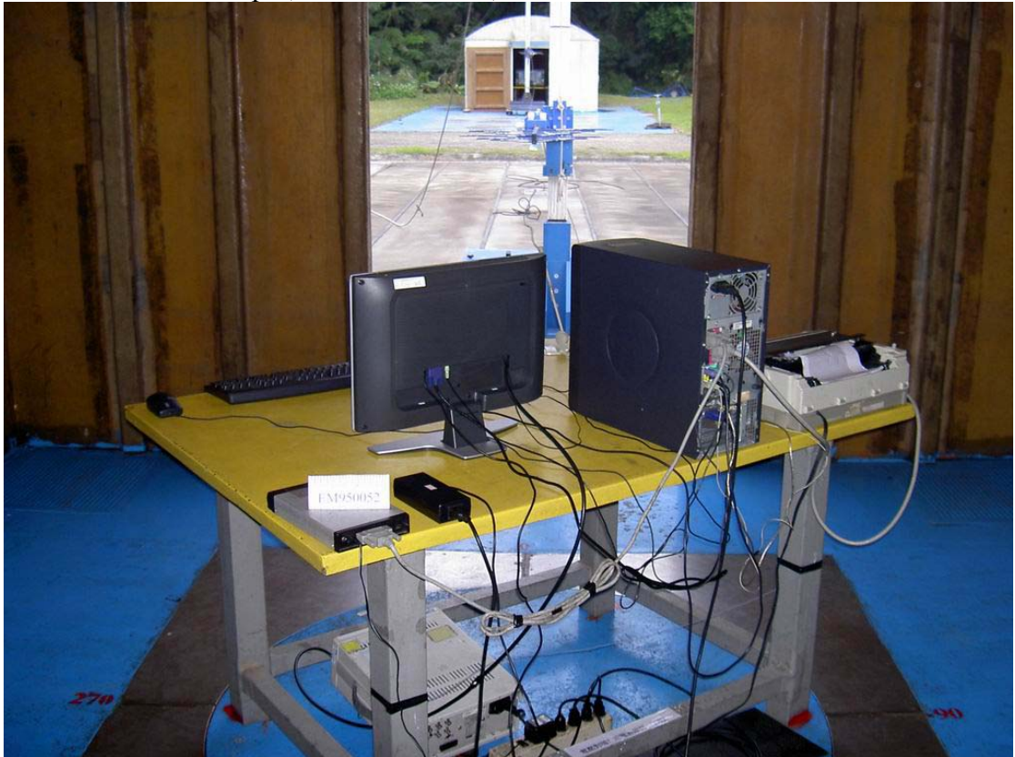
SETUP WITH MAXIMUM DETECTED EMISSION AT HORIZONTAL POLARIZATION

Test Mode: D-Sub Input, 1024*768/60Hz, 48kHz