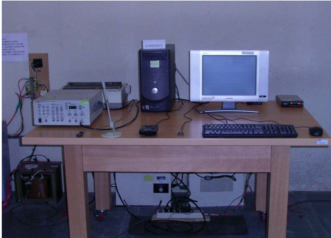
FRONT VIEW OF CONDUCTED TEST