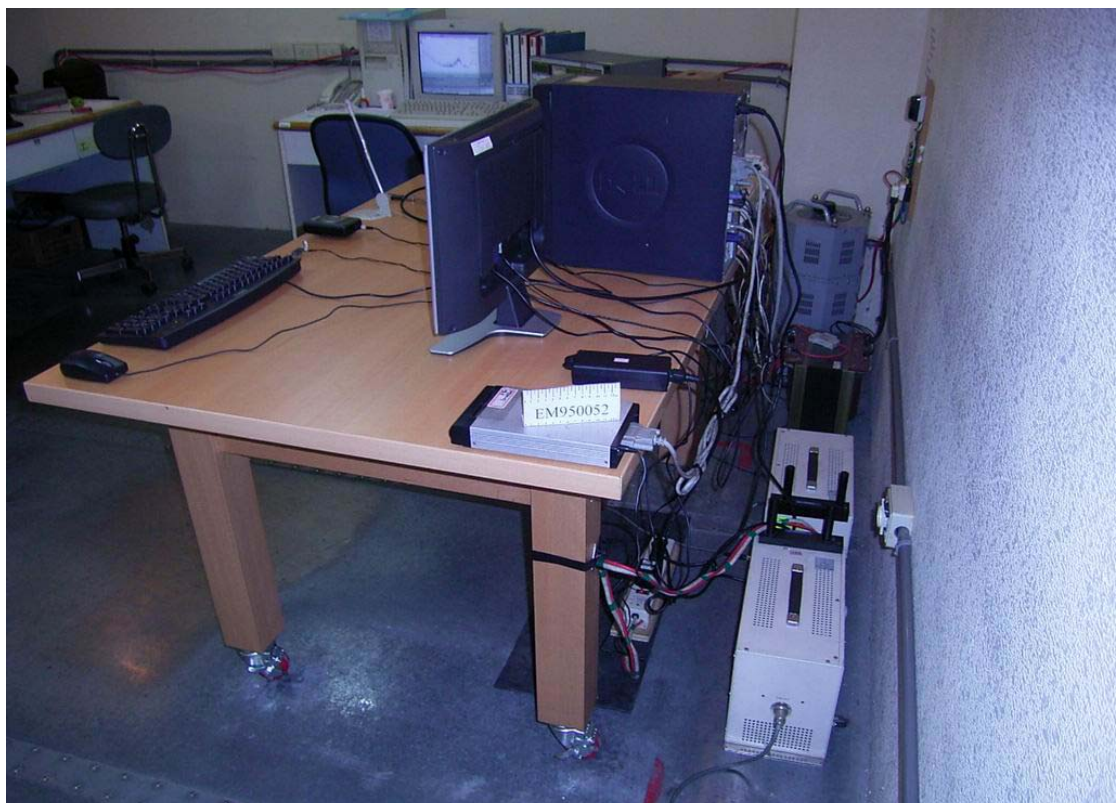
BACK VIEW OF CONDUCTED TEST