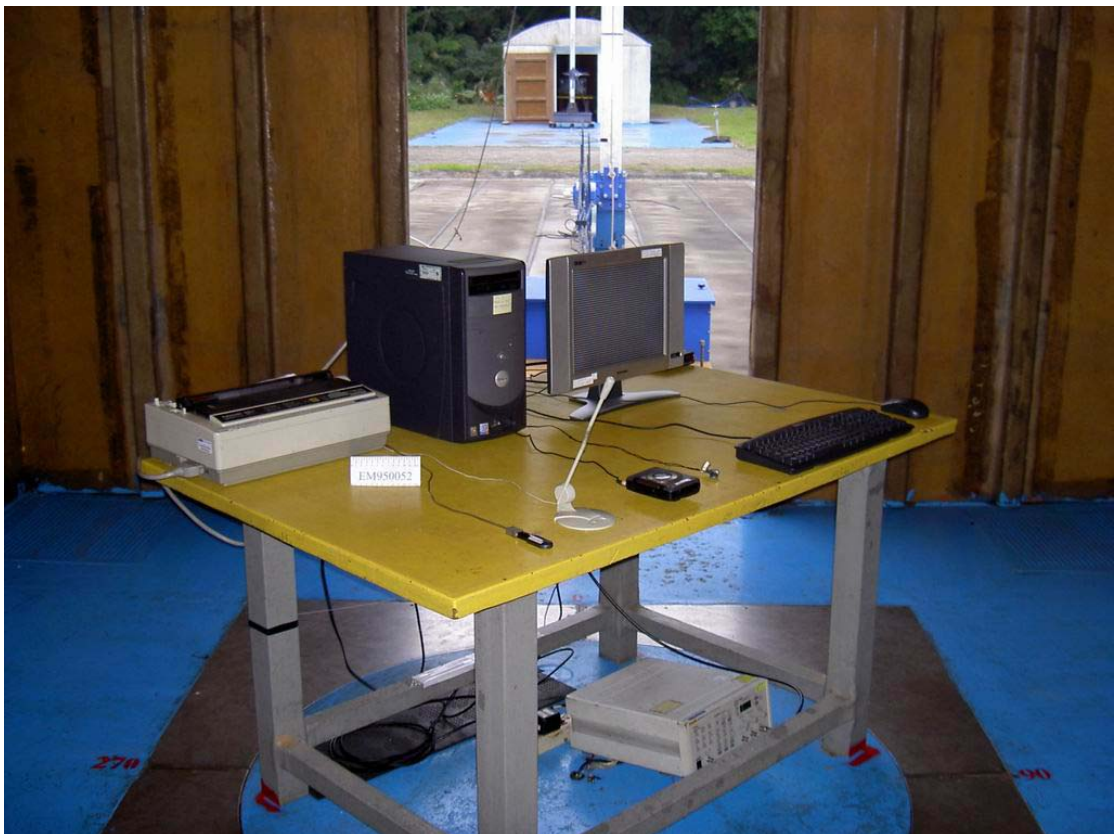
SETUP WITH MAXIMUM DETECTED EMISSION AT VERTICAL POLARIZATION