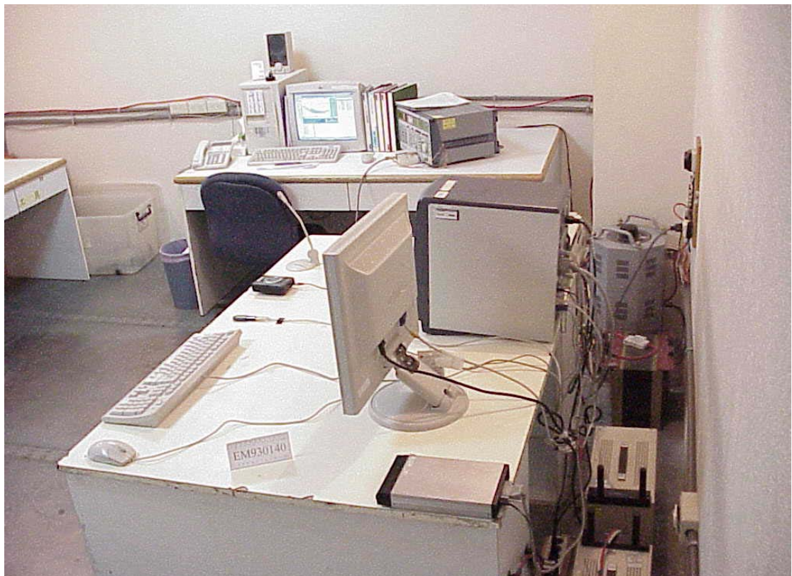
BACK VIEW OF CONDUCTED TEST