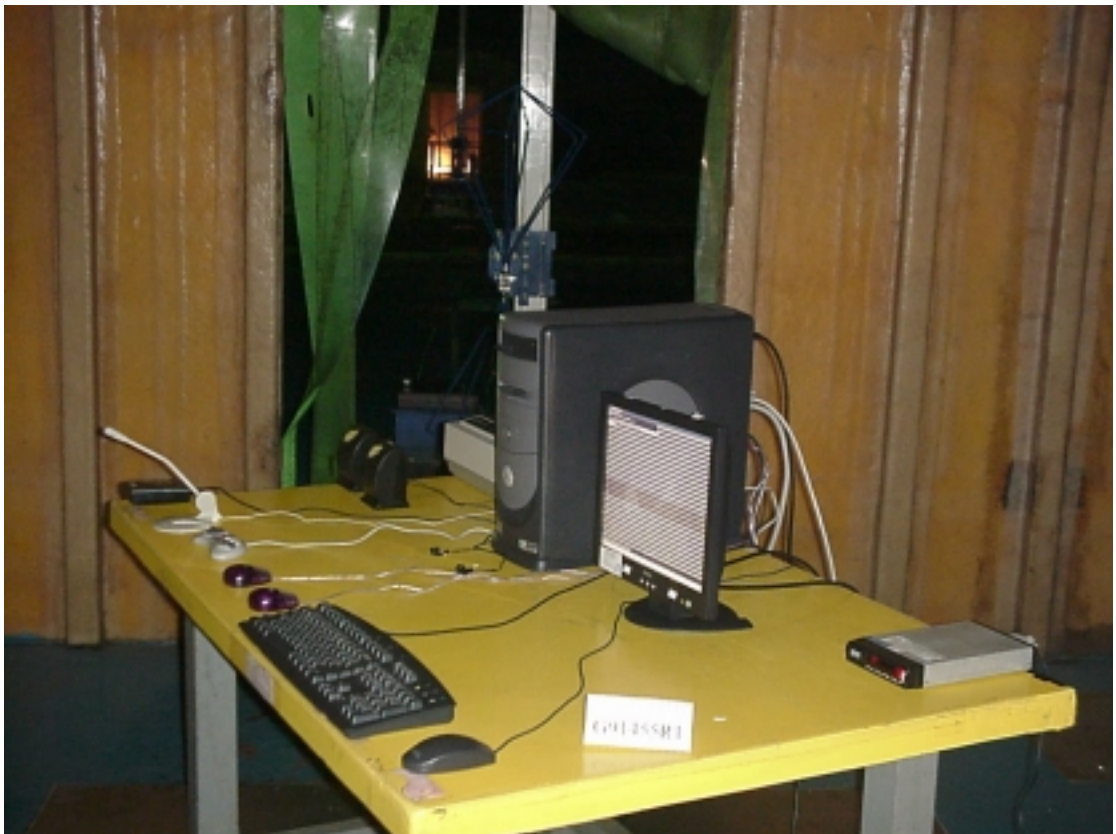
SETUP WITH MAXIMUM DETECTED EMISSION AT VERTICAL POLARIZATION