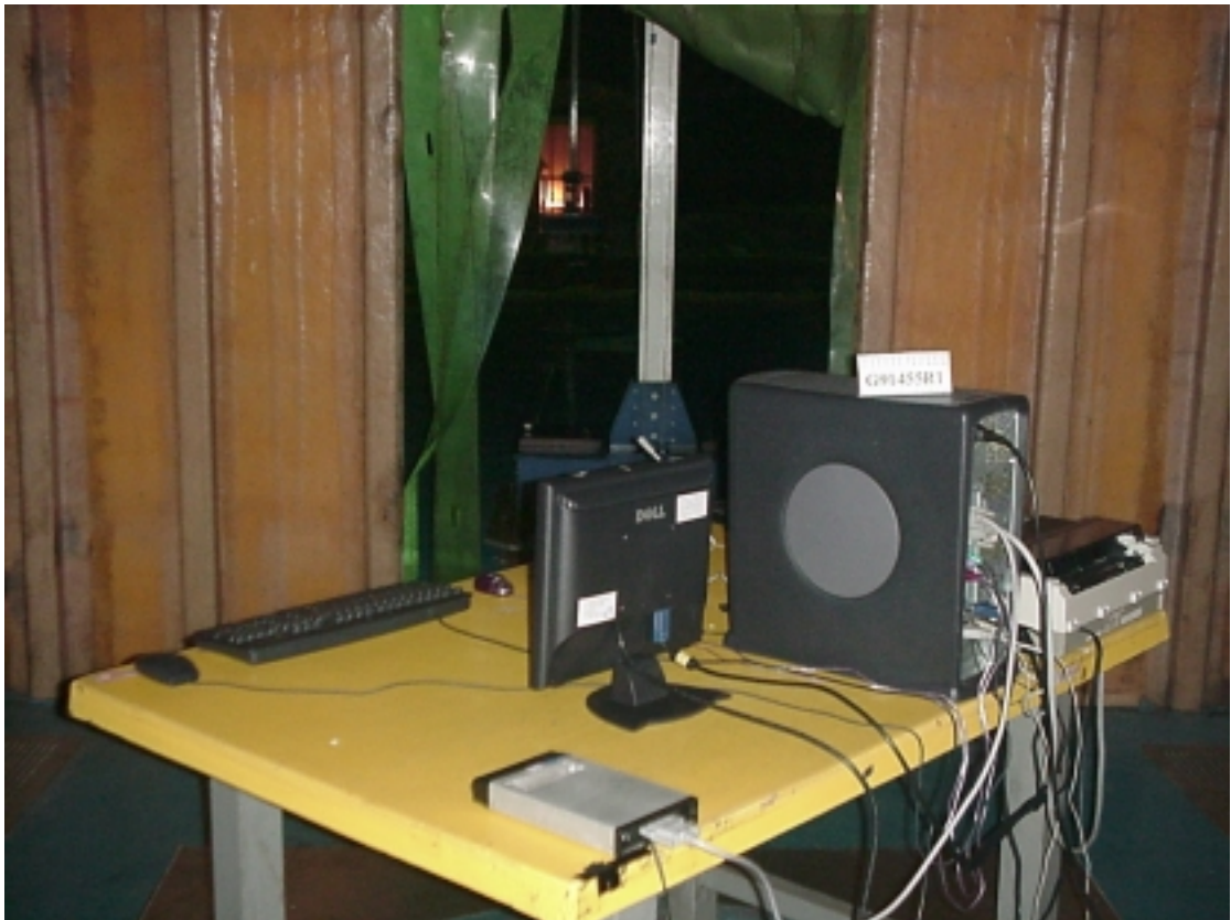
SETUP WITH MAXIMUM DETECTED EMISSION AT HORIZONTAL POLARIZATION