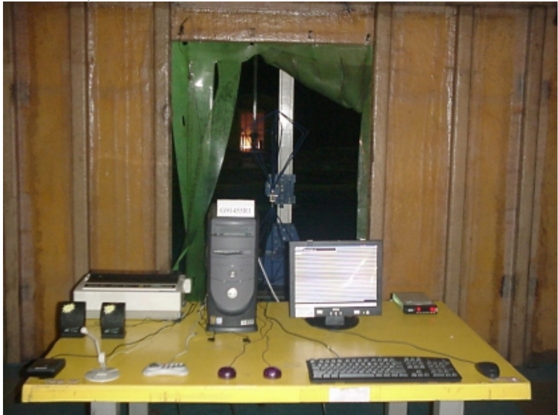
FRONT VIEW OF RADIATED TEST