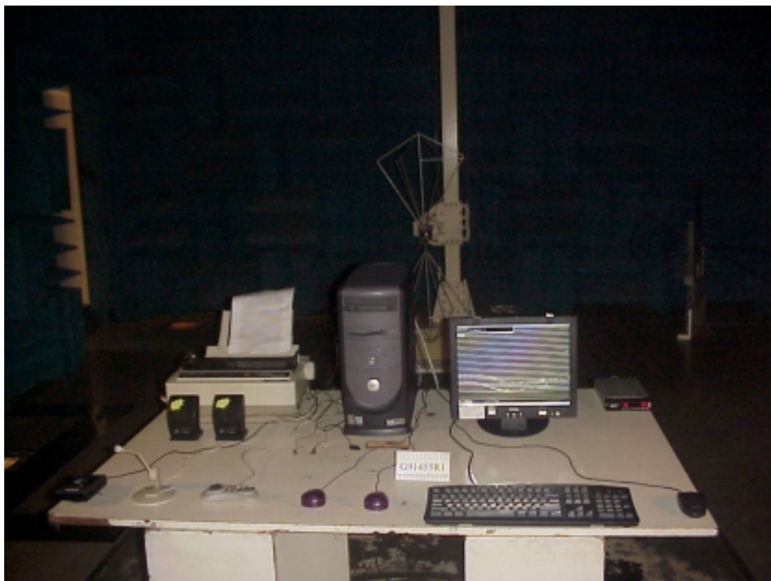
FRONT VIEW OF RADIATED TEST