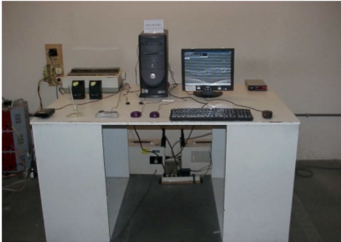
FRONT VIEW OF CONDUCTED TEST