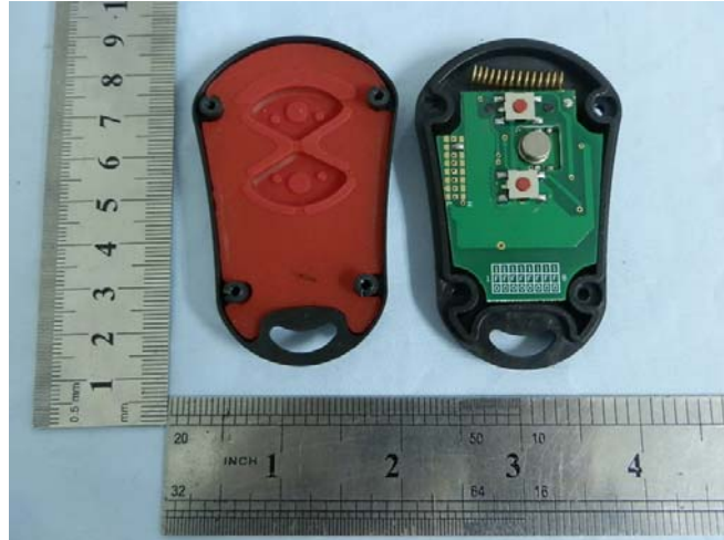
EUT –Uncovered View