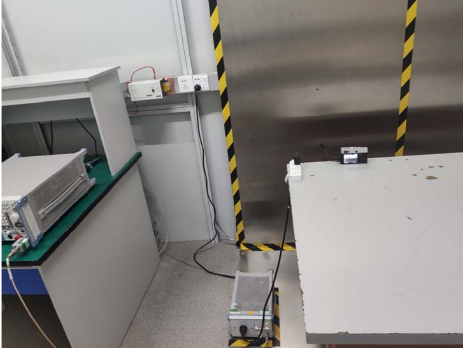
RF Conducted Emission