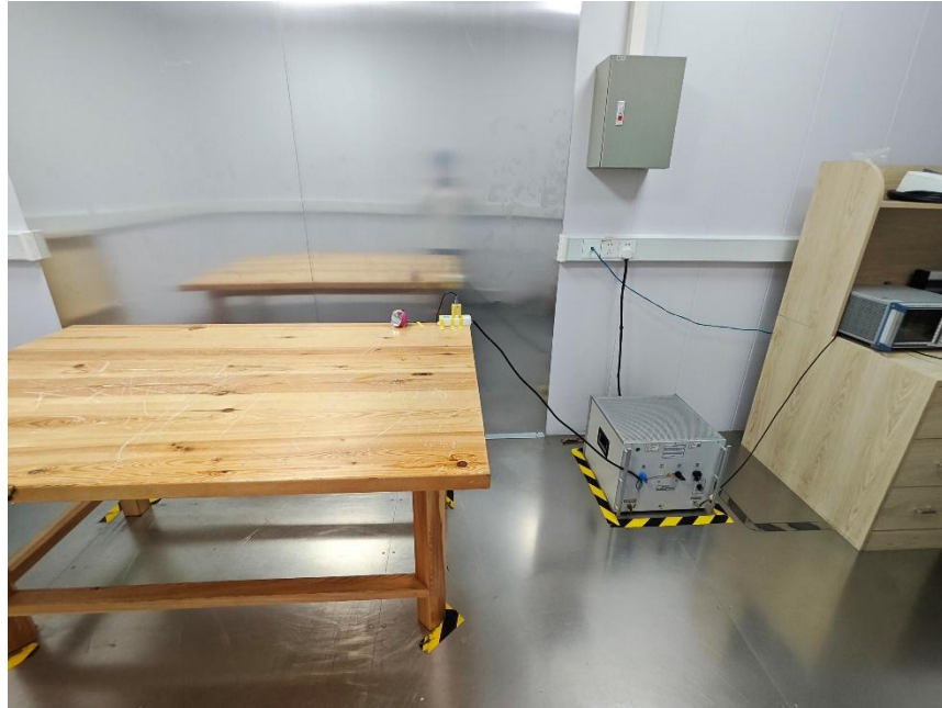
Radiated Spurious Emissions From 30MHz-1000MHz