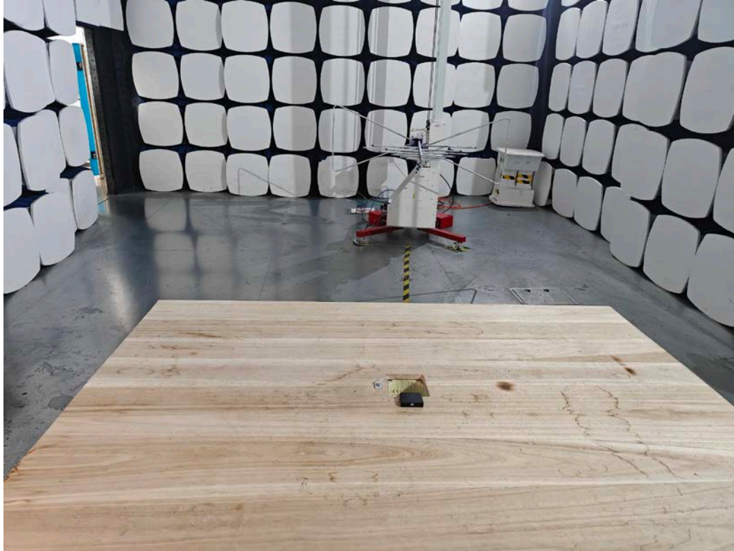
Radiated Emission (30MHz-1GHz)