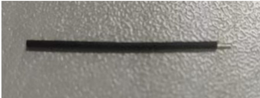
Figure 2-1 The antenna designed by HXT & The fixturing of W618

This report mainly provides the testing conditions of various electric and structural performance parameters for cell phone antenna ----W618 Figure 2-1 shows the antenna designed by HXT & The fixturing of W618