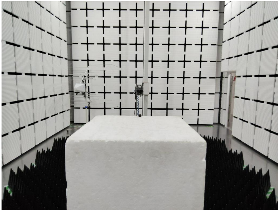
Radiated Spurious Emission (below 1GHz)