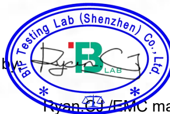
Ryan Q /EMC manager

Note: All the test results in this report only related to the testing samples. Which can be duplicated completely for the legal use with approval of applicant; it shall not be reproduced except in full without the written approval of BTF Testing Lab (Shenzhen) Co., Ltd., All the objections should be raised within thirty days from the date of issue. To validate the report, you can contact us.