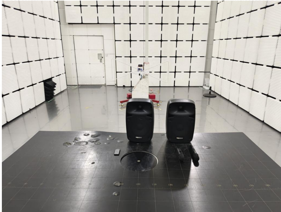
Emissions in Restricted Frequency Bands Emissions in Non-restricted Frequency Bands(Above 1 GHz)