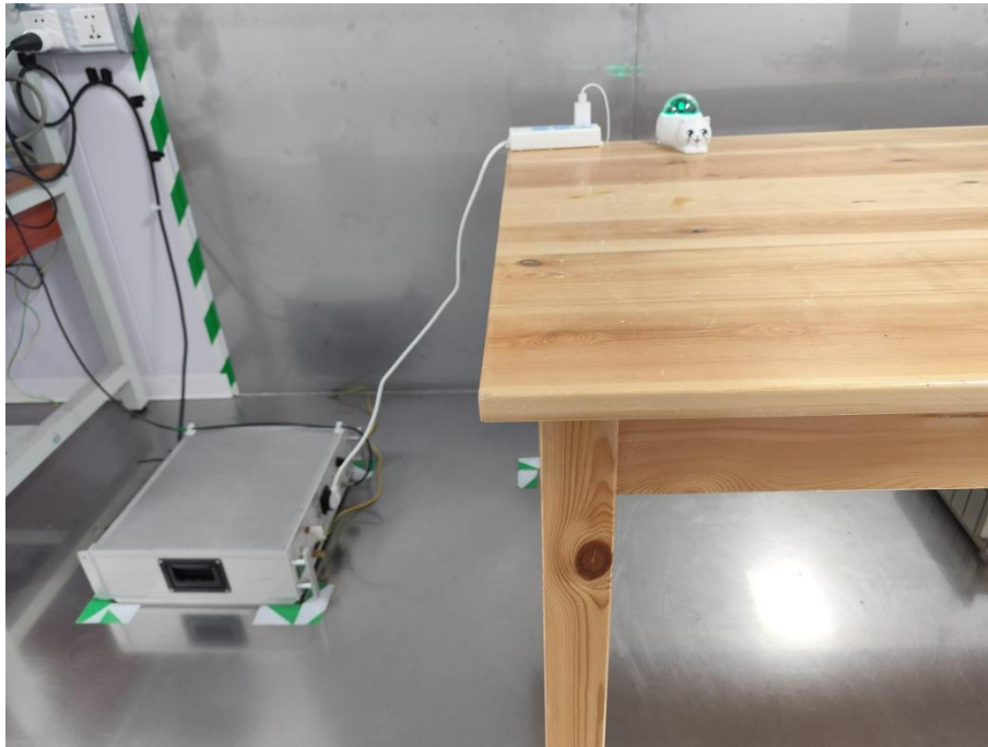
Conducted Emission at AC power line