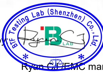
Ryan Gu /EMC manager

Note: All the test results in this report only related to the testing samples. Which can be duplicated completely for the legal use with approval of applicant; it shall not be reproduced except in full without the written approval of BTF Testing Lab (Shenzhen) Co., Ltd., All the objections should be raised within thirty days from the date of issue. To validate the report, you can contact us.