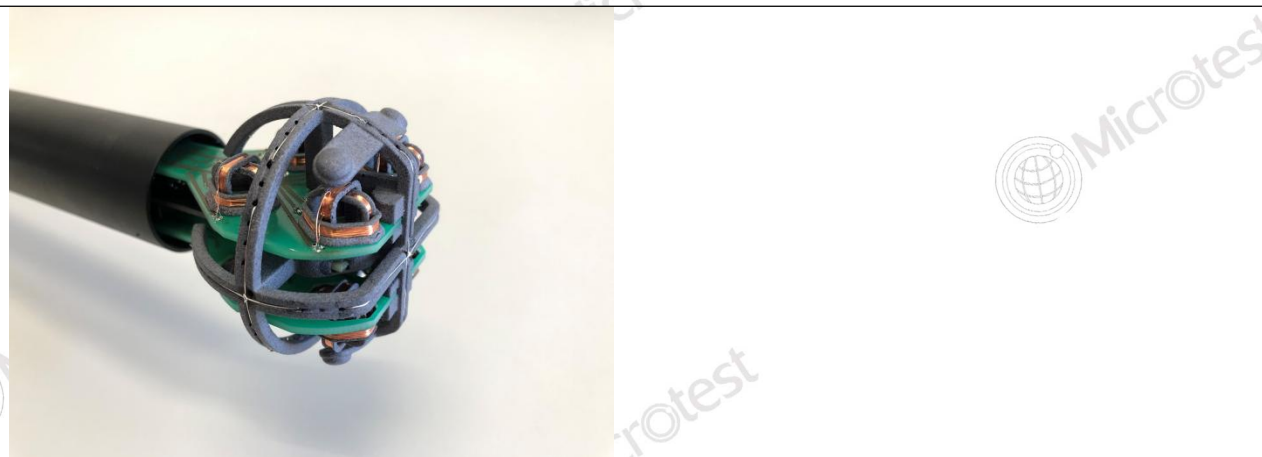
Test probe, without the casing