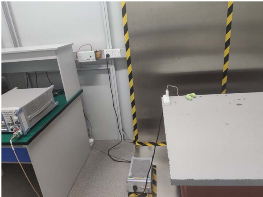
RF Conducted Emission