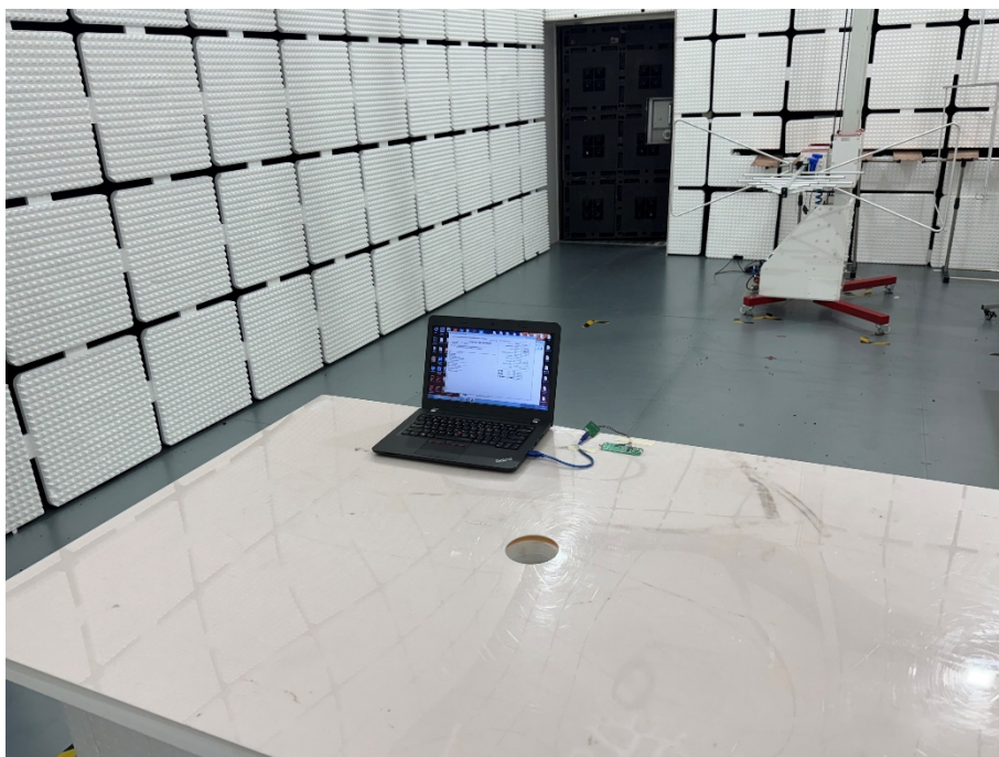
30MHz - 1GHz - 1