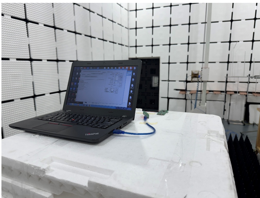
Above 1GHz - 2