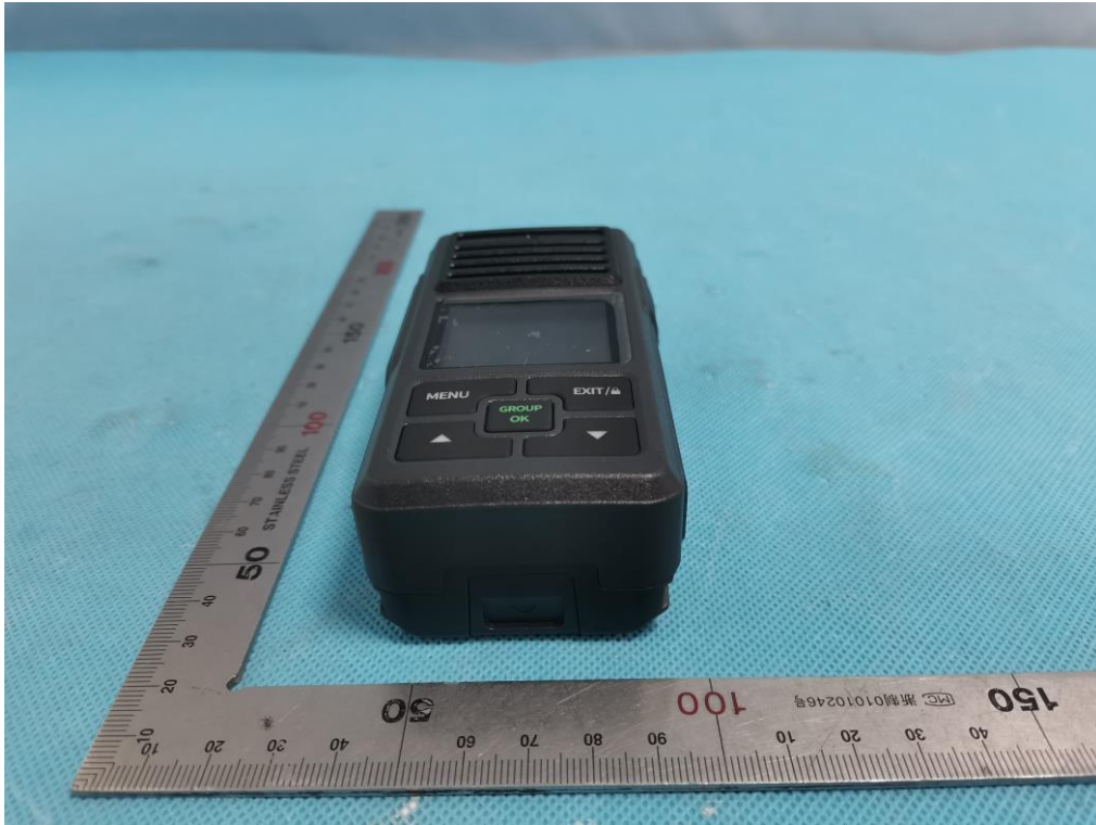
FRONT VIEW OF EUT