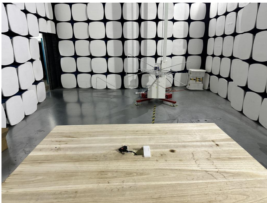
Radiated Emission (30MHz-1GHz)