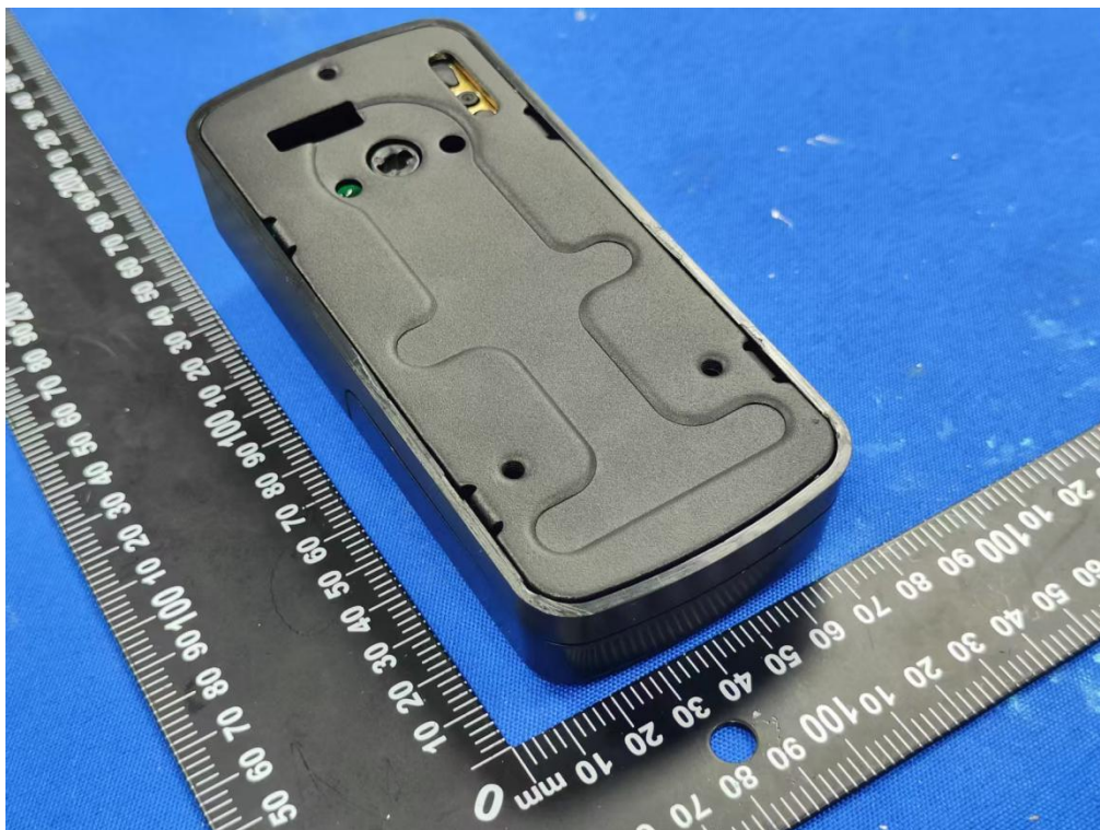
Figure 10. Overall view of unit(Model:WLM13F-SNL)