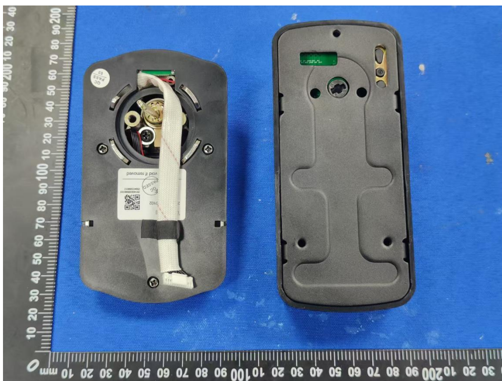
Figure 8. Overall view of unit(Model:WLM13F-SNL)