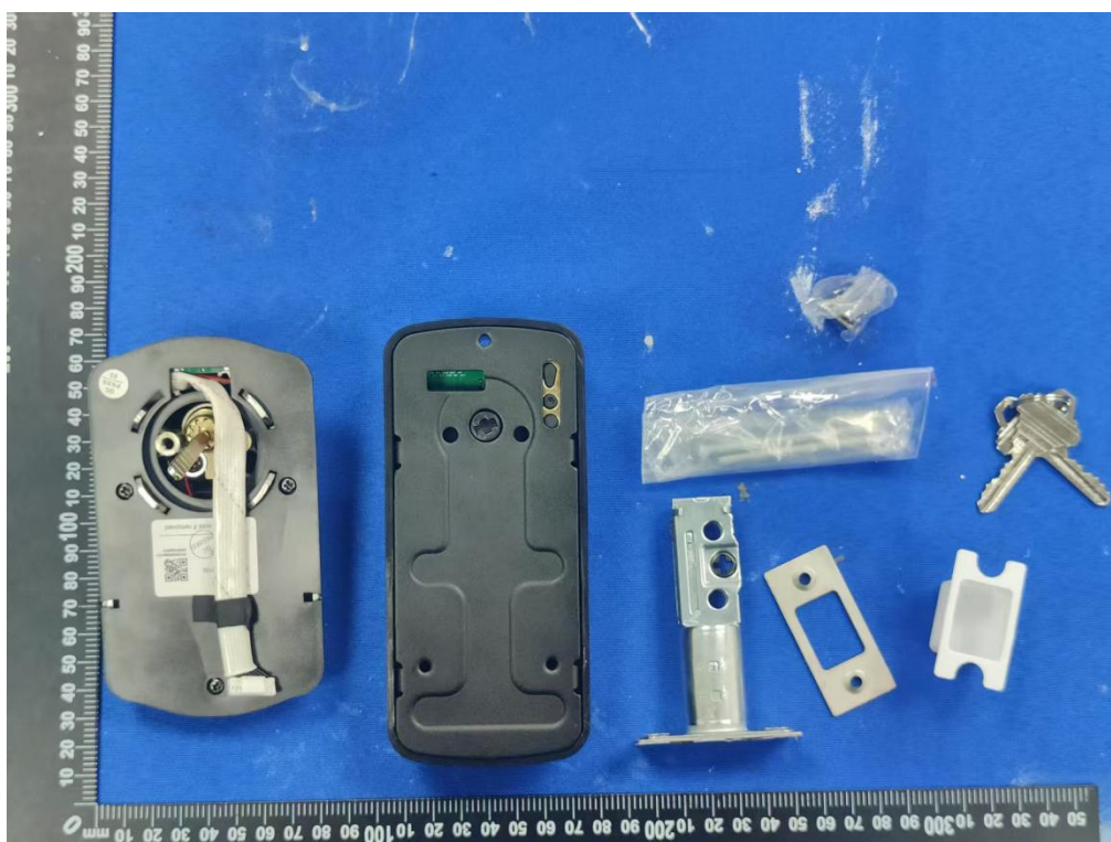
Figure 6. Overall view of unit(Model:WLM13F-SNL)