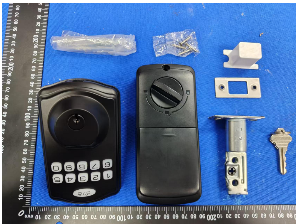
Figure 1. Overall view of unit(Model:WLM13F-BLK)