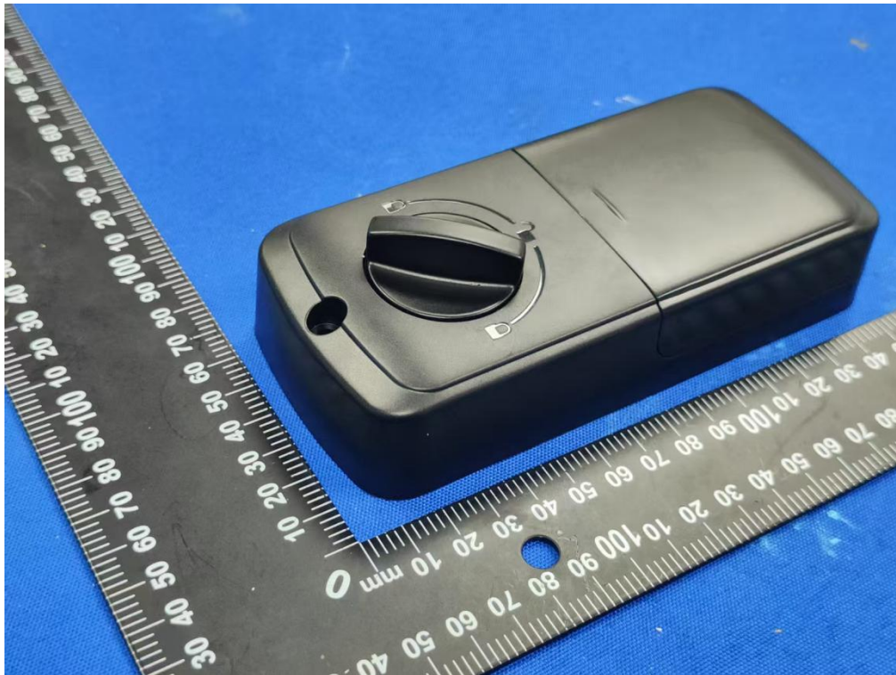
Figure 9. Overall view of unit(Model:WLM13F-SNL)