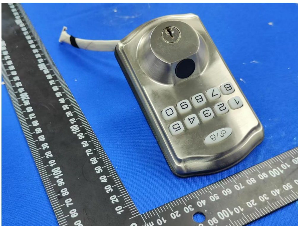
Figure 11. Overall view of unit(Model:WLM13F-SNL)