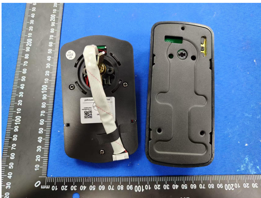
Figure 4. Overall view of unit(Model:WLM13F-BLK)