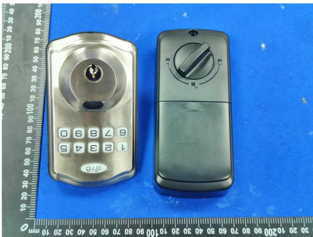
Figure 7. Overall view of unit(Model:WLM13F-SNL)