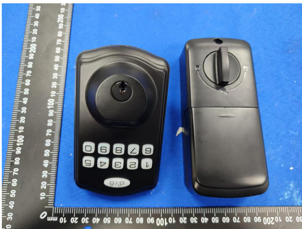
Figure 2. Overall view of unit(Model:WLM13F-BLK)