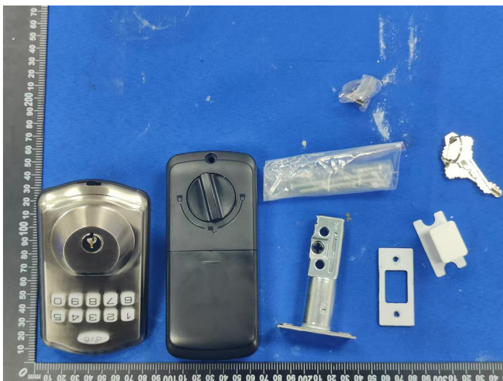
Figure 5. Overall view of unit(Model:WLM13F-SNL)