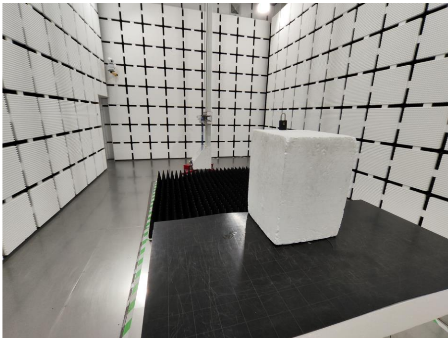
Radiated Spurious Emission above 1GHz