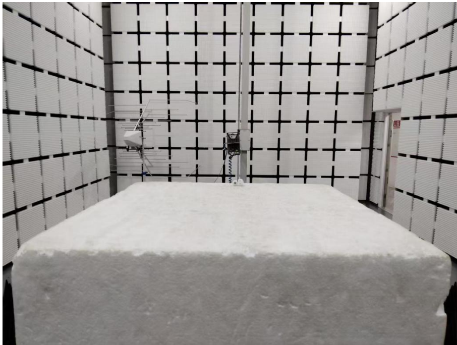
Radiated Spurious Emission (below 1GHz)