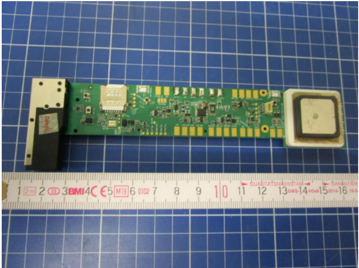
Figure 3: PCB Back