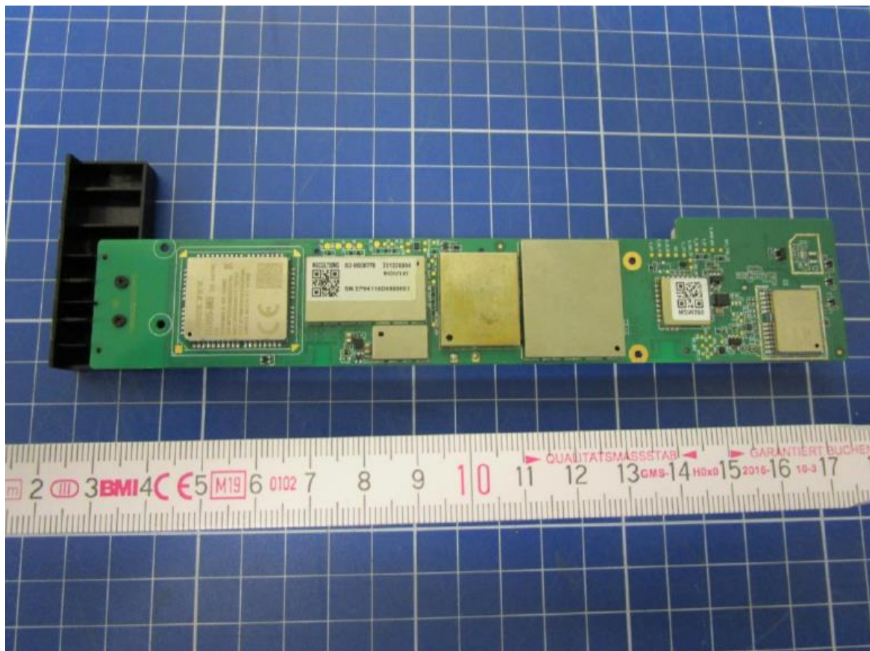
Figure 1: PCB Front with Shields