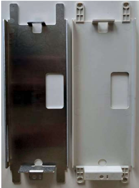
Image: Click mount metal and plastic viewed from above