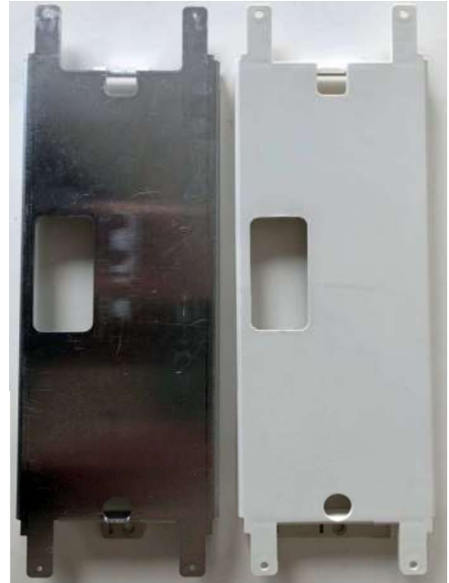
Image: Click mount metal and plastic viewed from below