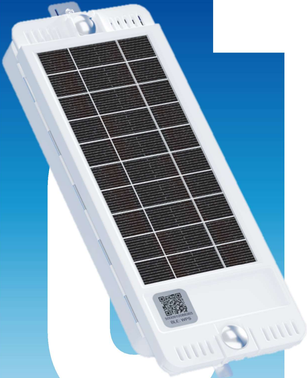
IoTgo® Track-Solar iot