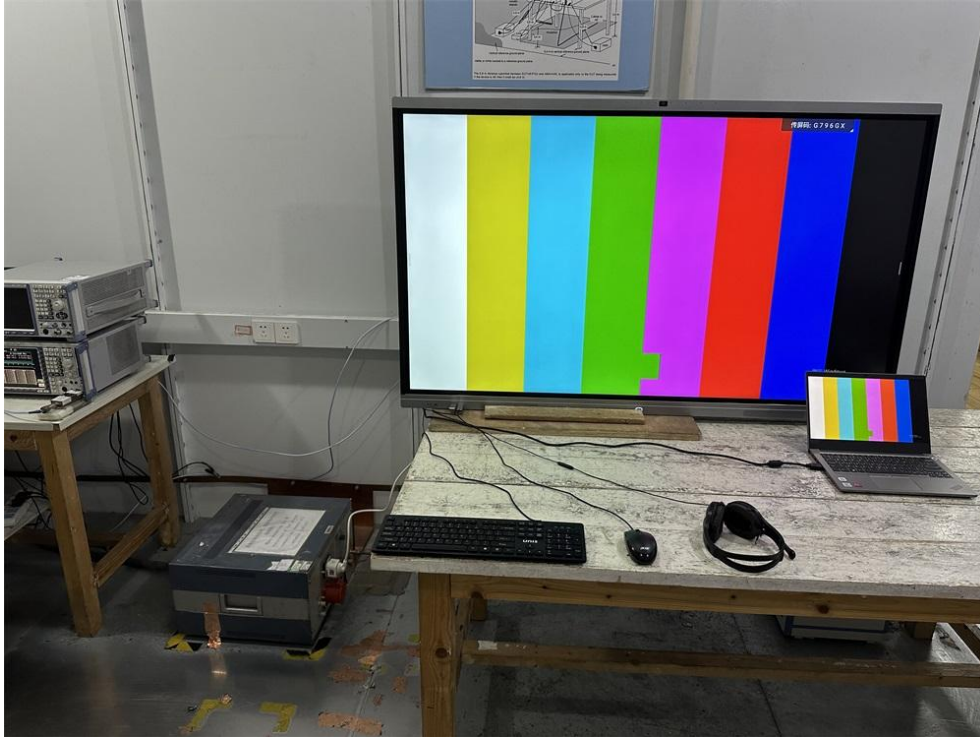
Fig. 3 Photo of DFS