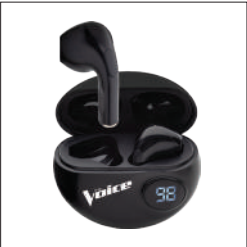
Earbuds Charging Case