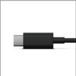
USB Charging Cable