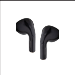
LIVE TWS Earbuds