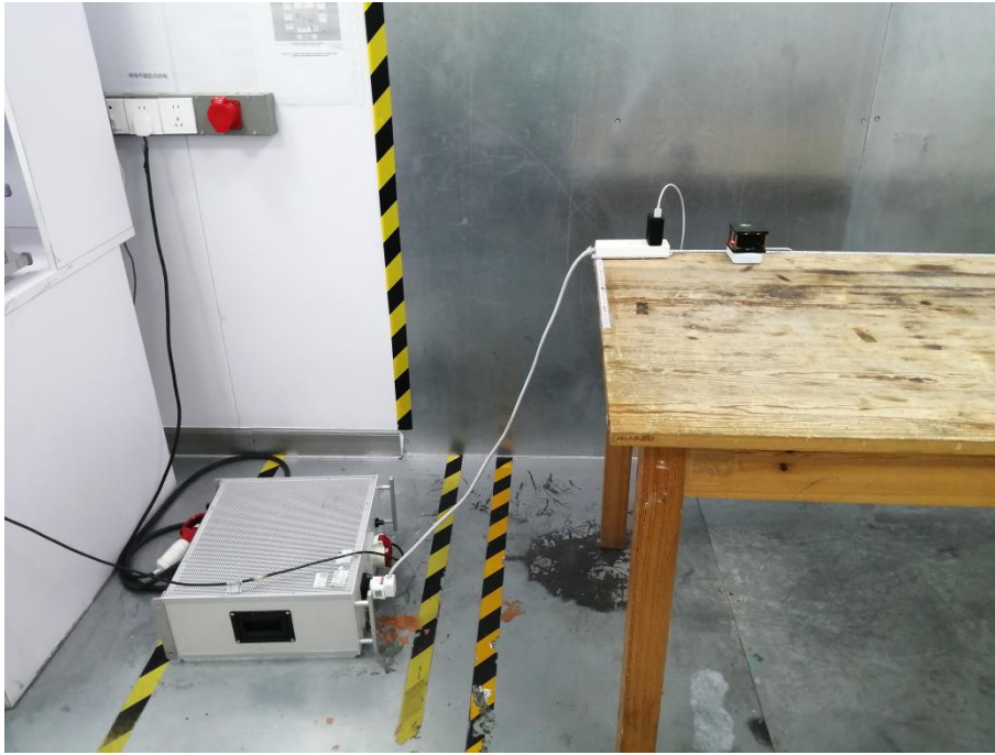
Emissions in frequency bands (below 30MHz)