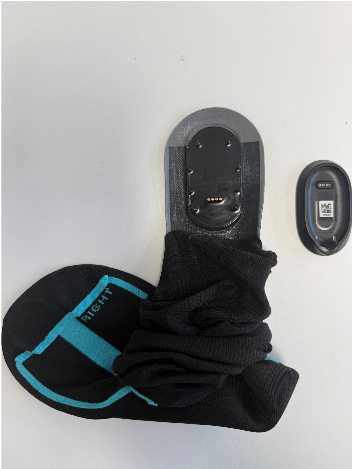
Sock Internal pcb coated in epoxy