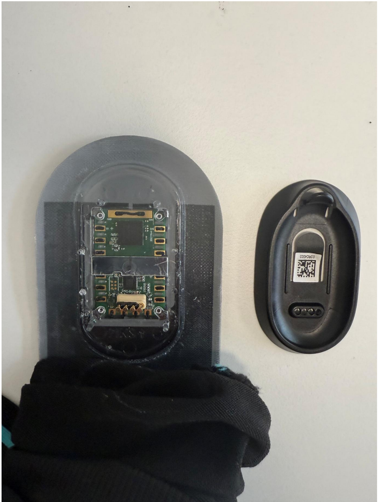
Sock Internal pcb epoxy removed