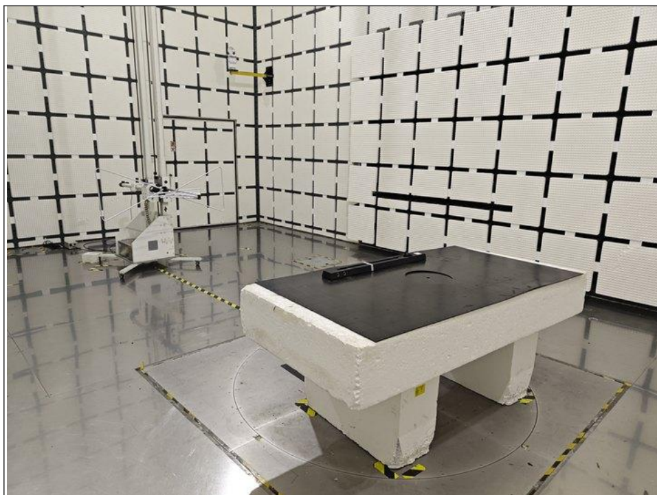
RADIATED EMISSION TEST (Below 1GHz)