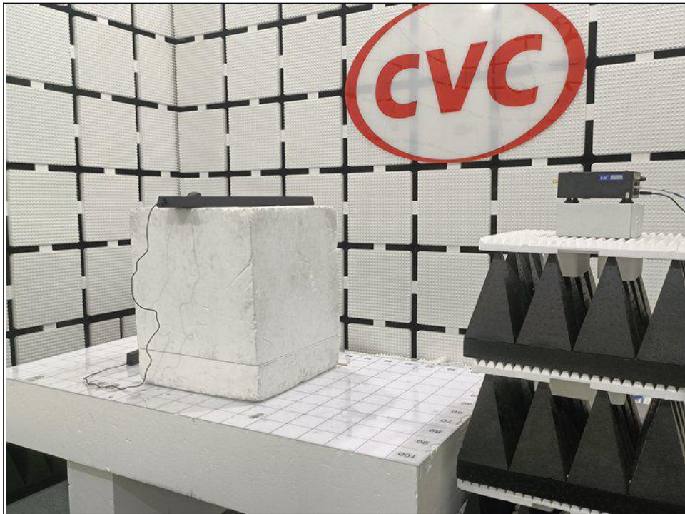
RADIATED EMISSION TEST (140-200GHz)