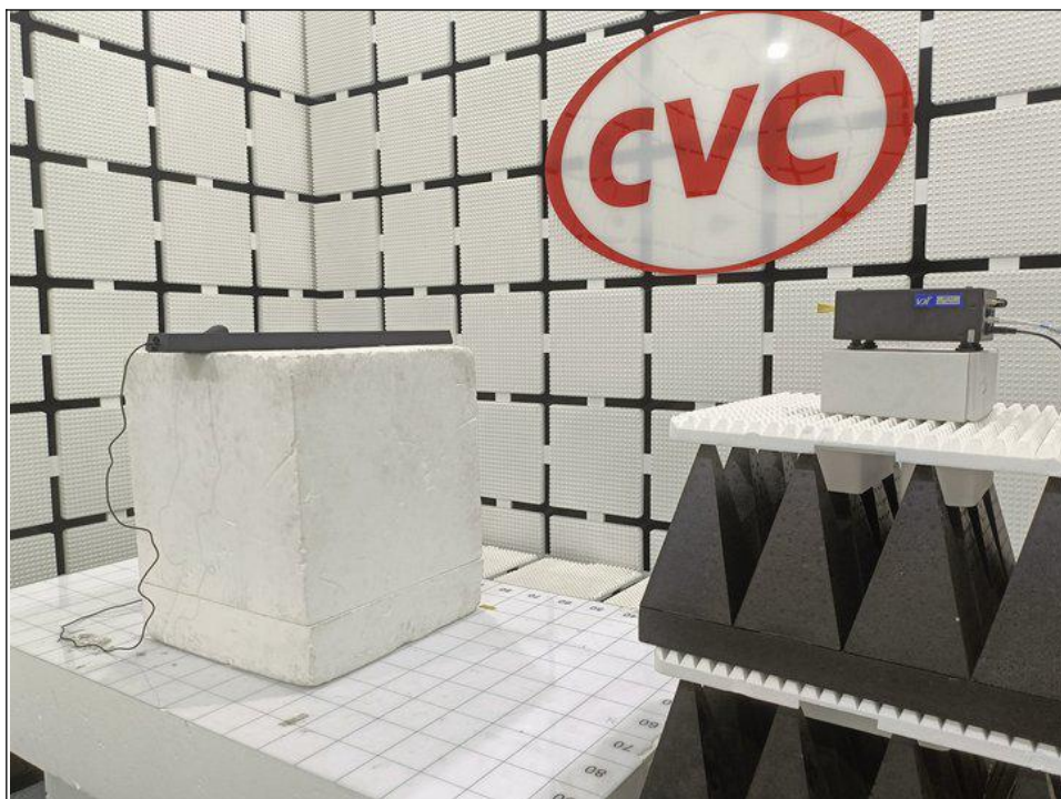
RADIATED EMISSION TEST (90-140GHz)