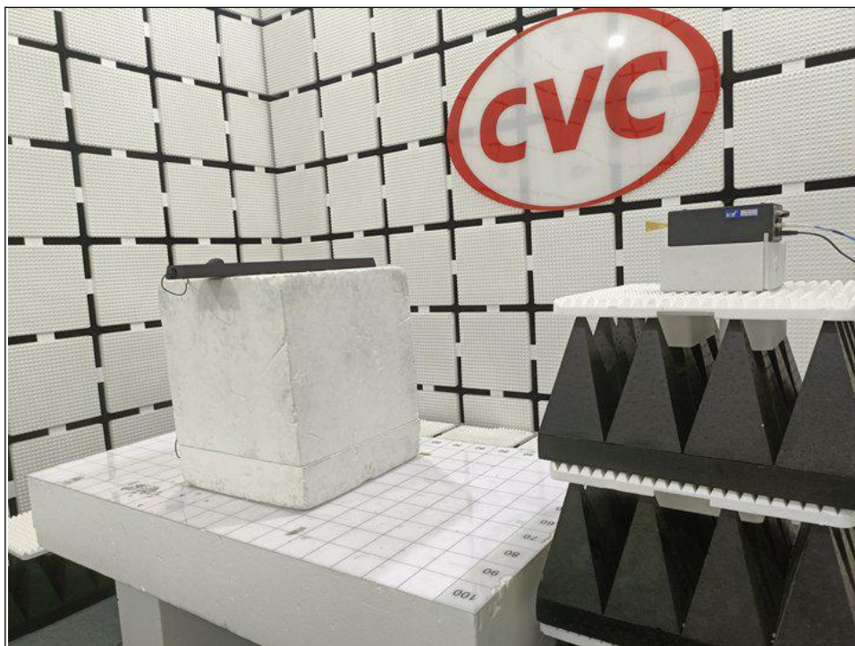
RADIATED EMISSION TEST (60-90GHz)