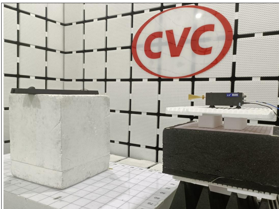
RADIATED EMISSION TEST (40-60GHz)