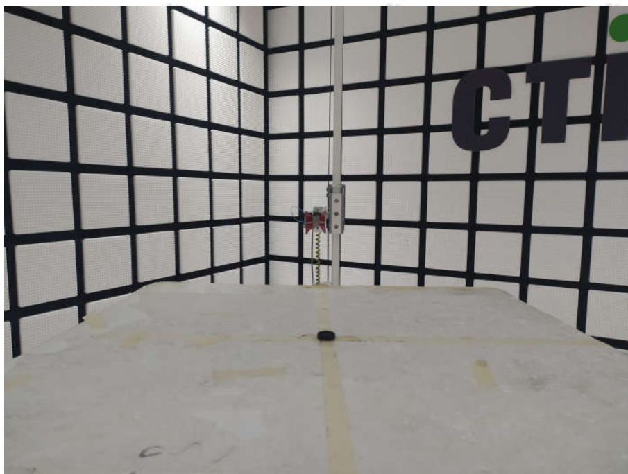
Radiated spurious emission Test Setup-2(Above 1GHz)