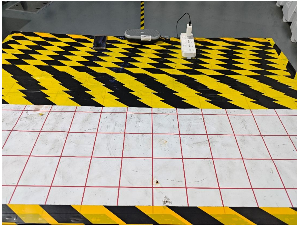
Radiated emission test: Below 1GHz