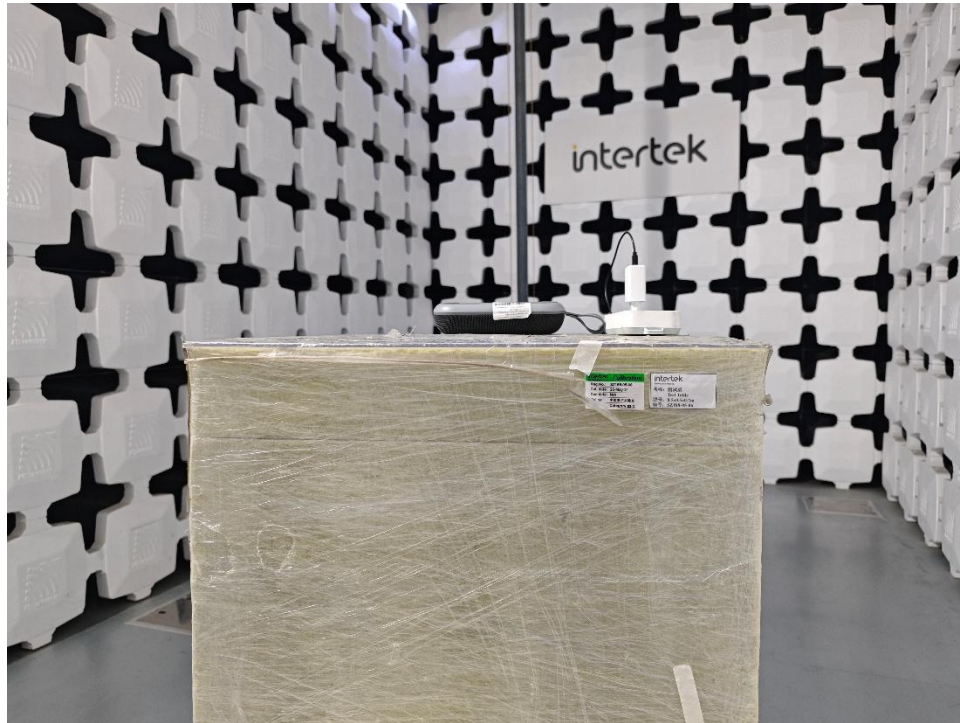
Radiated emission test: Above 1GHz