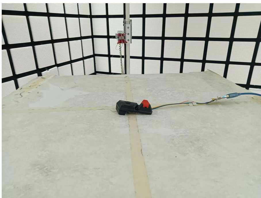
Radiated spurious emission Test Setup-2(Above 1GHz)