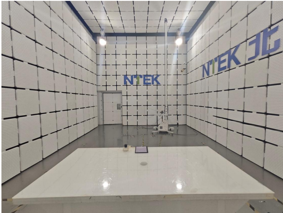
Radiated Measurement Photos