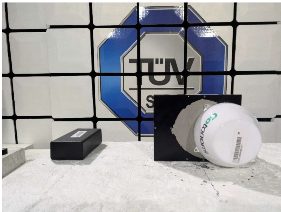
Figure 25 - Radiated Emissions, Z-Plane