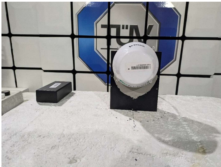
Figure 24 - Radiated Emissions, Y-Plane