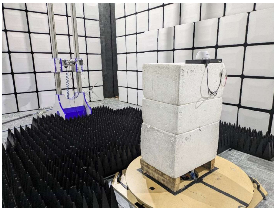
Figure 22 - Radiated Emissions, 8 GHz to 18 GHz