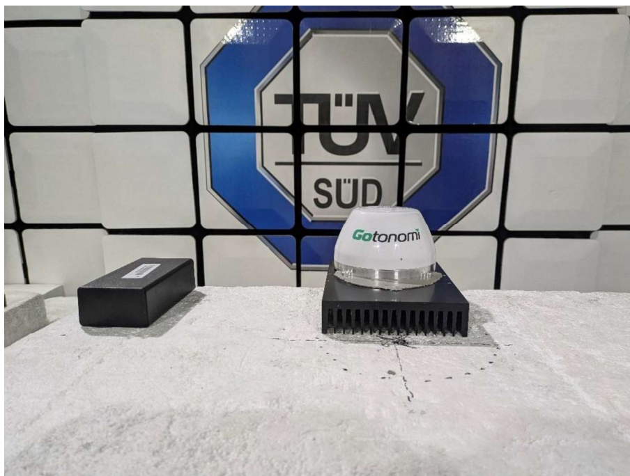
Figure 23 - Radiated Emissions, X-Plane